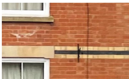
Mixed Brick Flush String Course