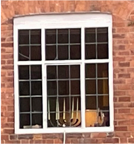
White Casement Windows