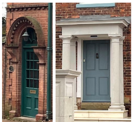
Rounded or Flat Top Door Hoods