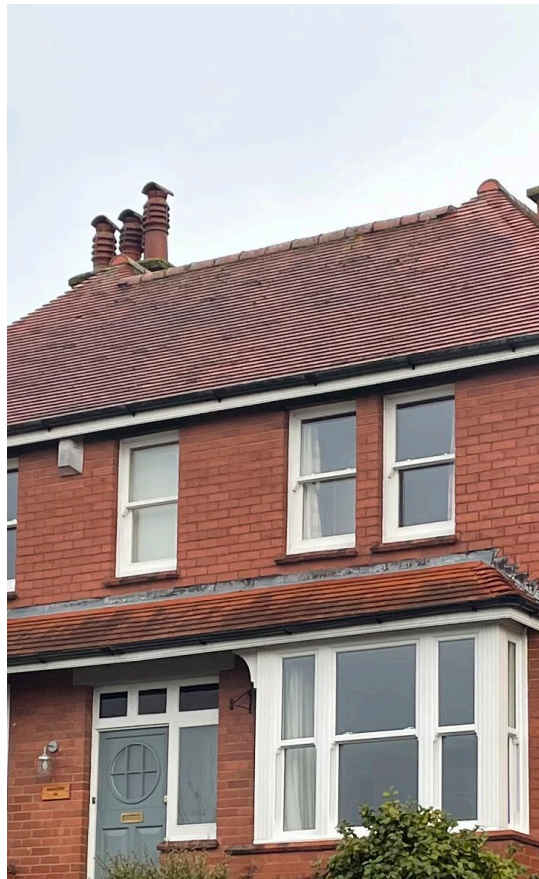
Red/Brown Roof Tiles