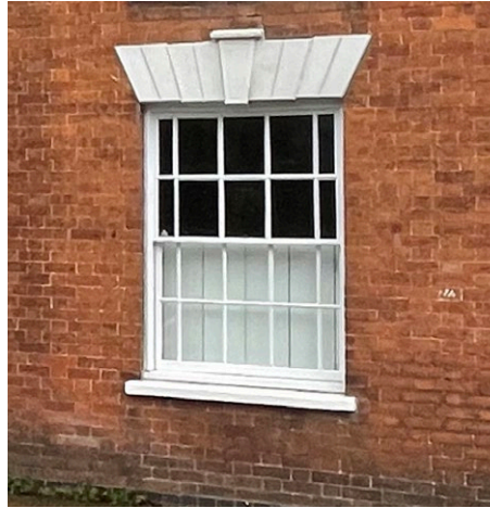
Timber Sash Windows