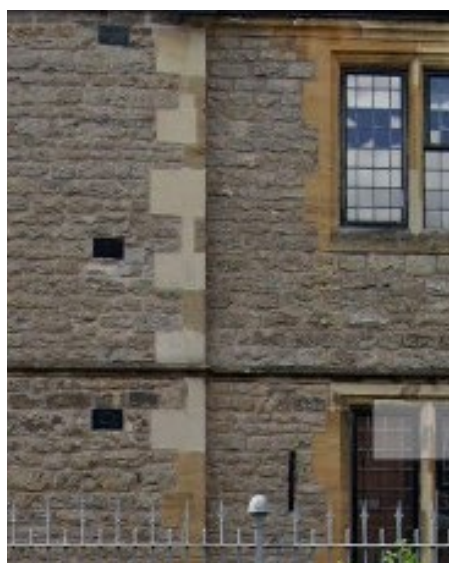
Use of stone with contrasting quoins