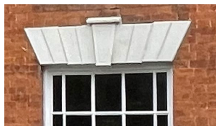
Stone or Brick Window Head