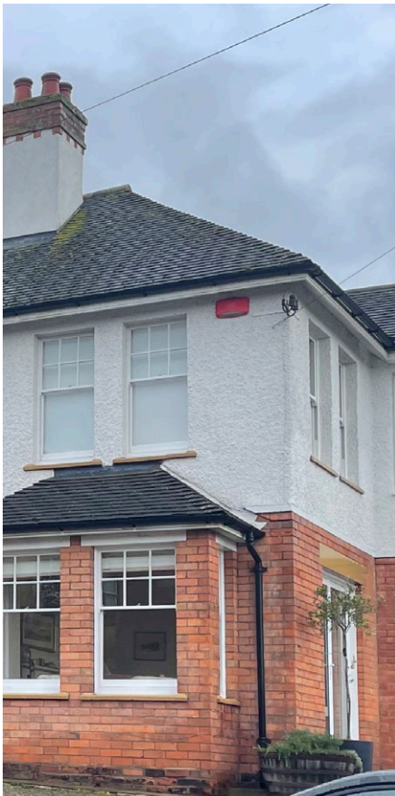
Red Brick & Off-White Half Render