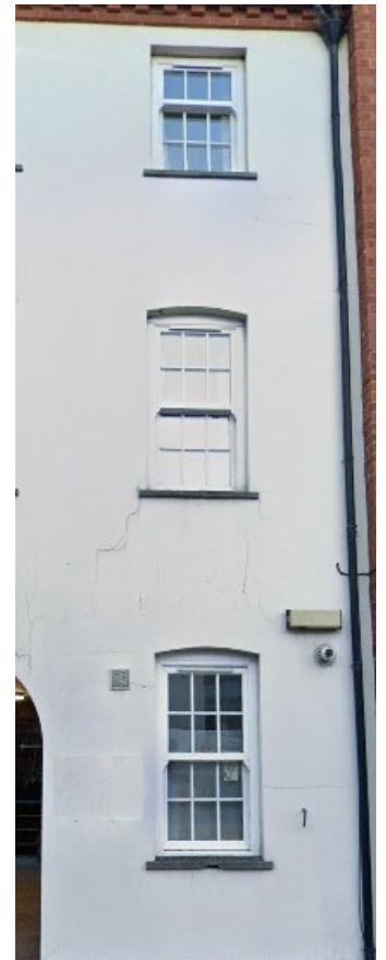
3 storey building. Use of Off White Render