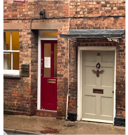
Solid or Glazed Panel Doors in Various Colours