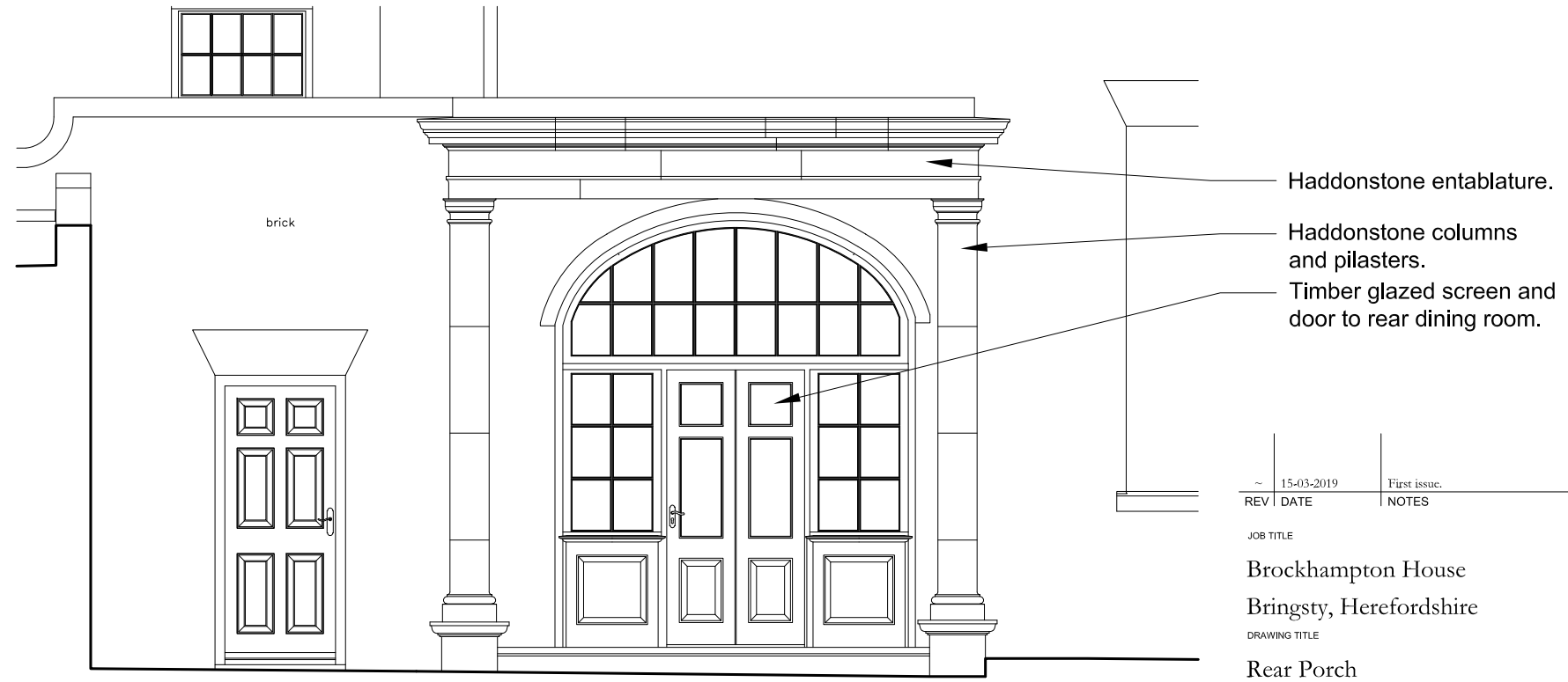
North Elevation of Porch - Scale 1:50

NOTES: Do not scale from this drawing - responsibility is not accepted for errors made by others in scaling from this drawing. All dimensions are to be checked on site prior to construction. Any discrepancies are to be reported to Philip Hughes Associates for clarification.