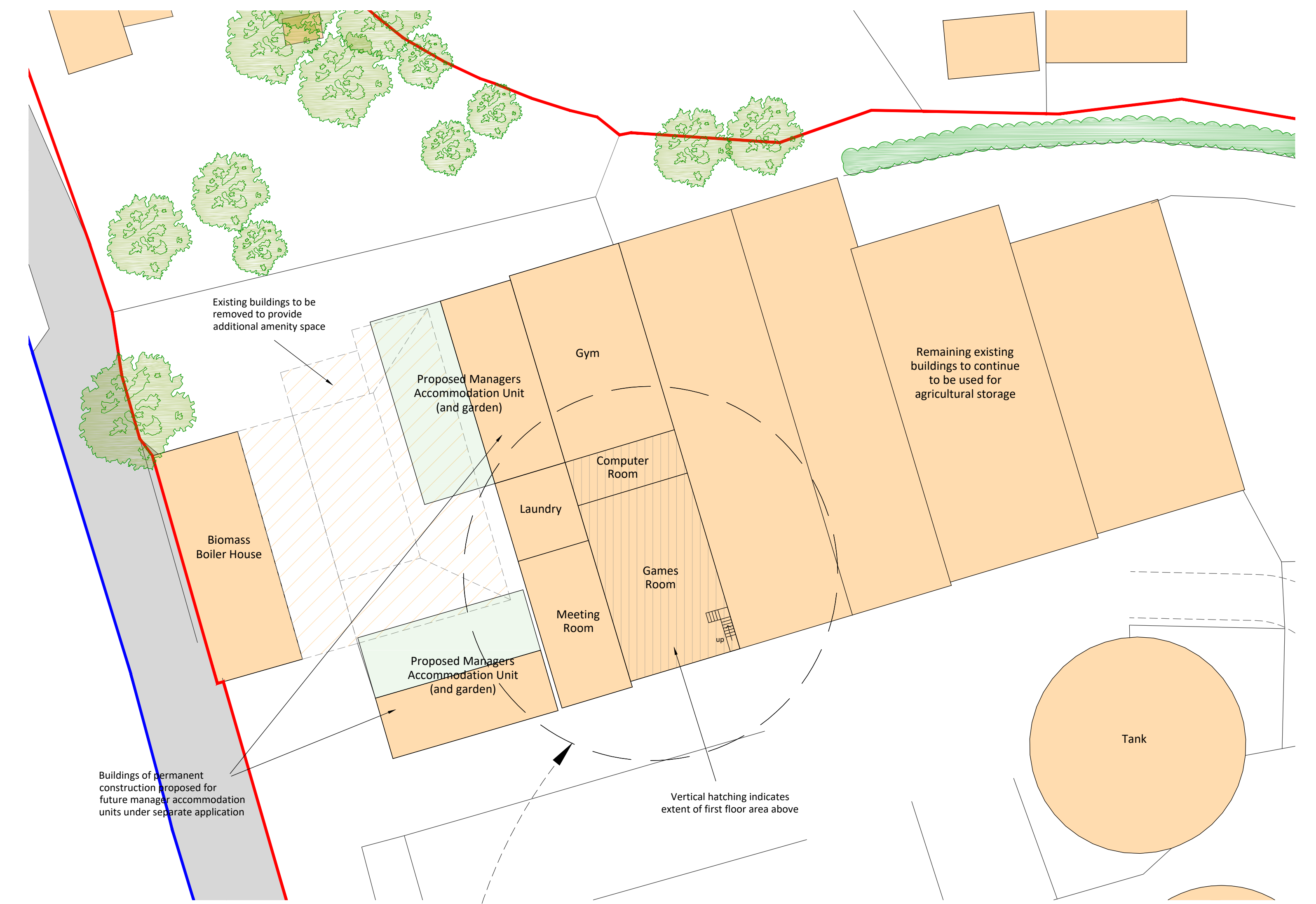
Enlarged View of Existing Lodge Farmyard Showing Proposals for Buildings (Scale 1:250)

* Refer to "Soft Landscaping Scheme" Document for full details of Proposed Plantings