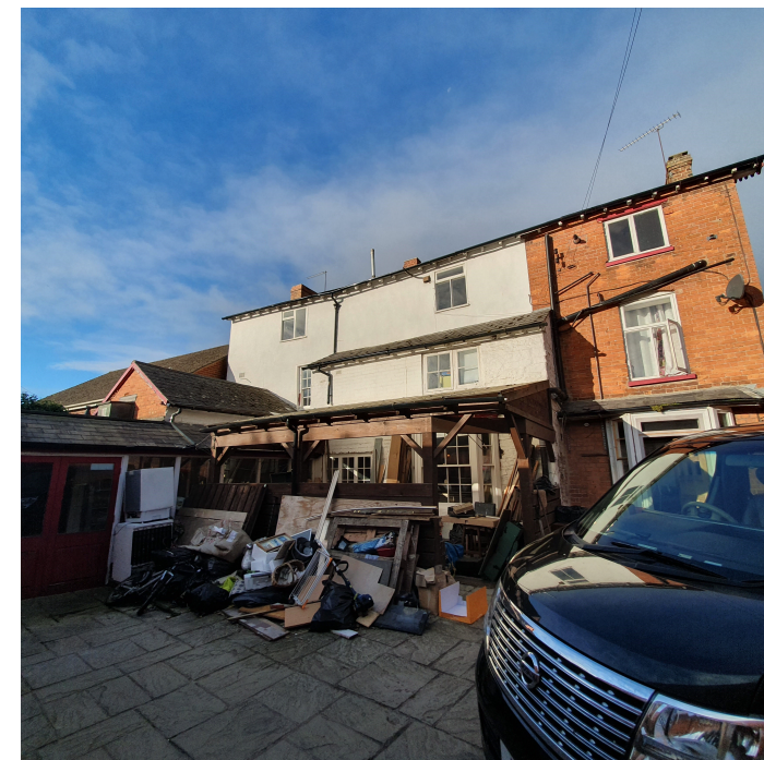
Photograph of existing rear elevation