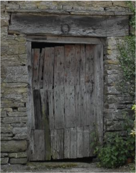
ED0.06 - Site photo