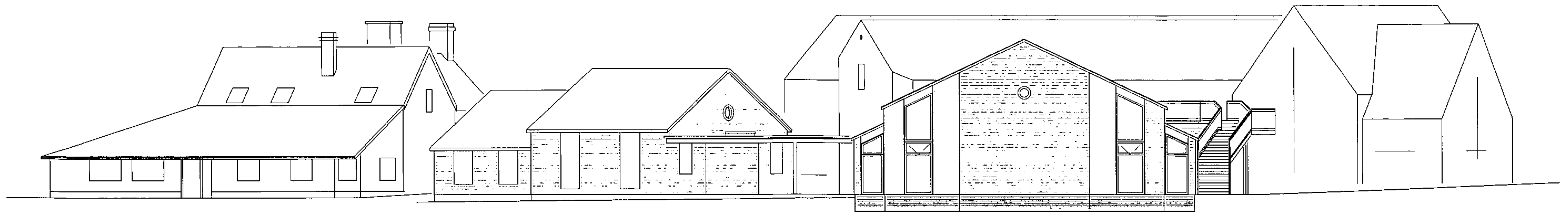
SOUTH EAST ELEVATION AS EXISTING Scale 1:200