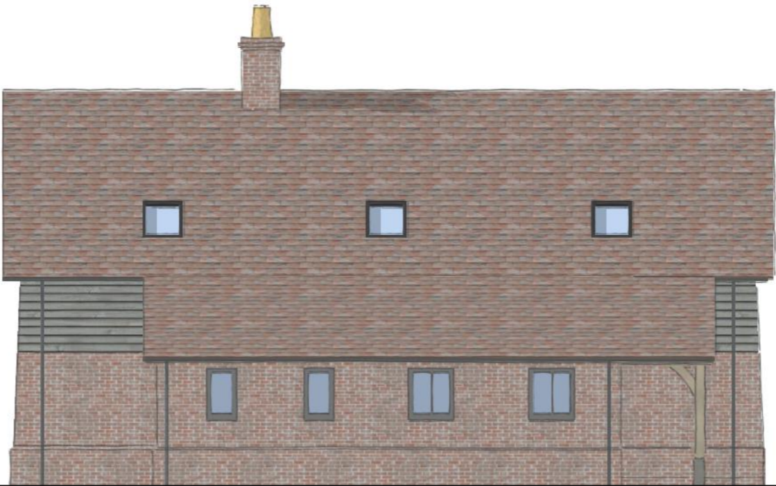
EAST ELEVATION Scale 1:100