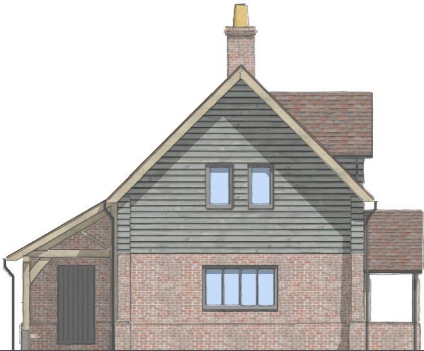
NORTH ELEVATION Scale 1:100