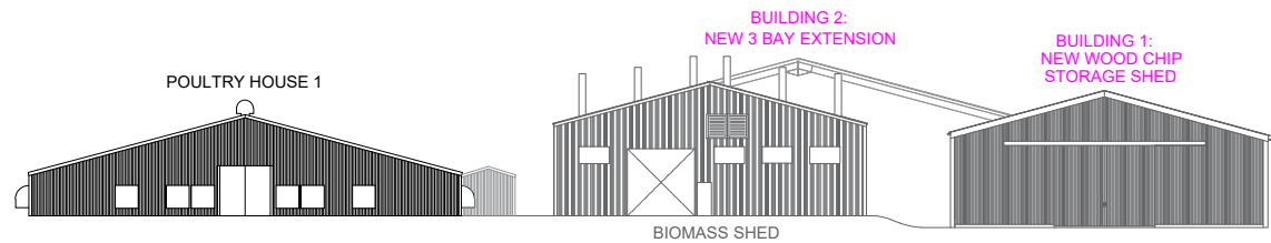
SOUTH ELEVATION 0 5 10 15 20 25 30m