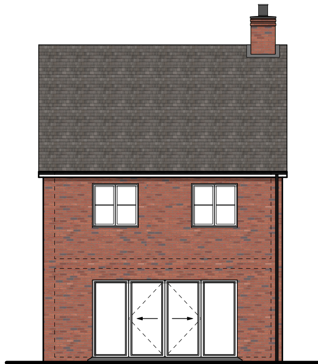
Plot 6 Rear Elevation