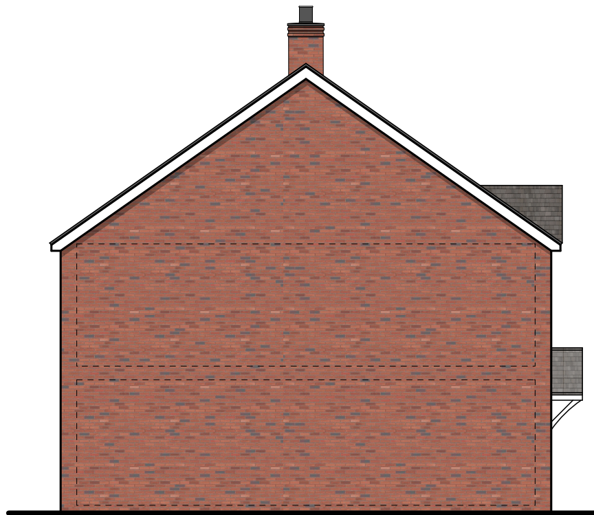
Plot 6 Side Elevation