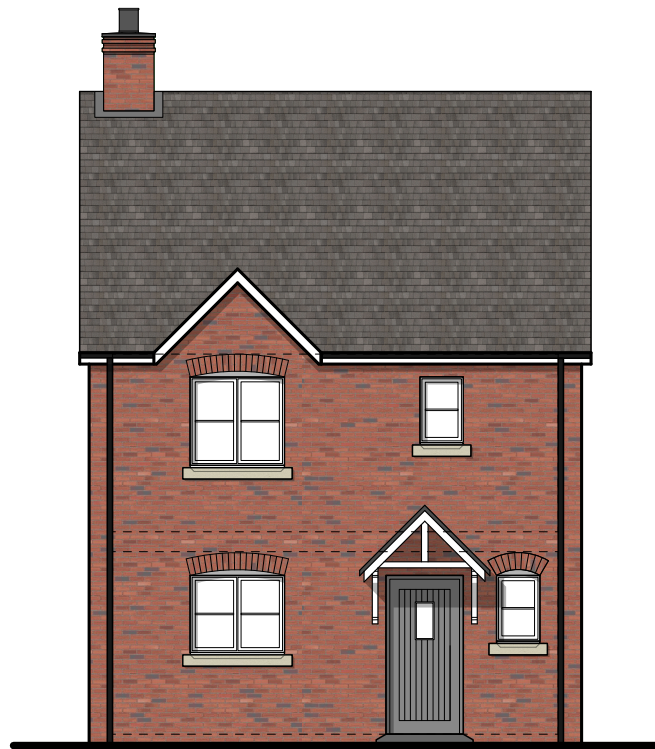
Plot 6 Front Elevation