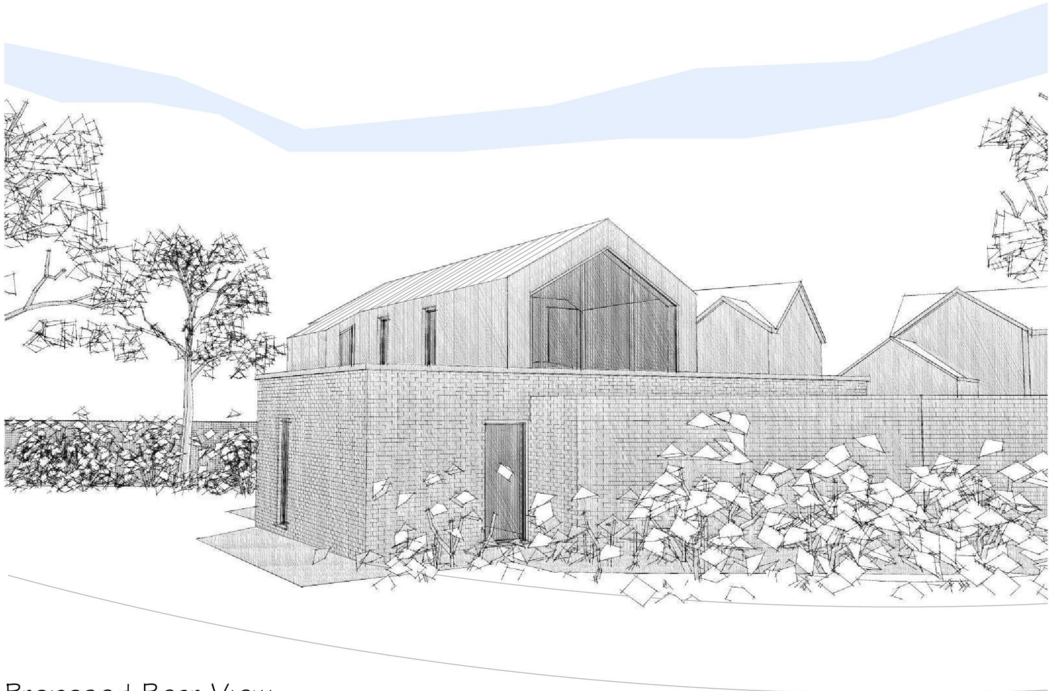
Proposed Rear View

coombes : everitt architects Limited Unit No.1, The Old Dairy Rushley Lane Winchcombe Gloucestershire GL54 5JE t: 01242 807727 f: 0845 5575833 e: info@ce-architects.co.uk www.ce-architects.co.uk