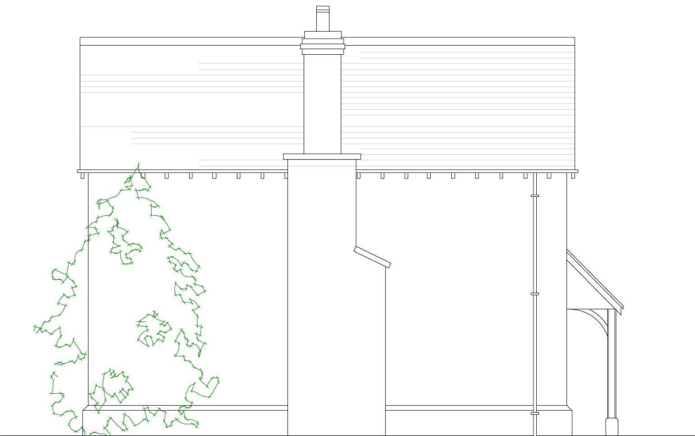
W e s t e l e v a t i o n