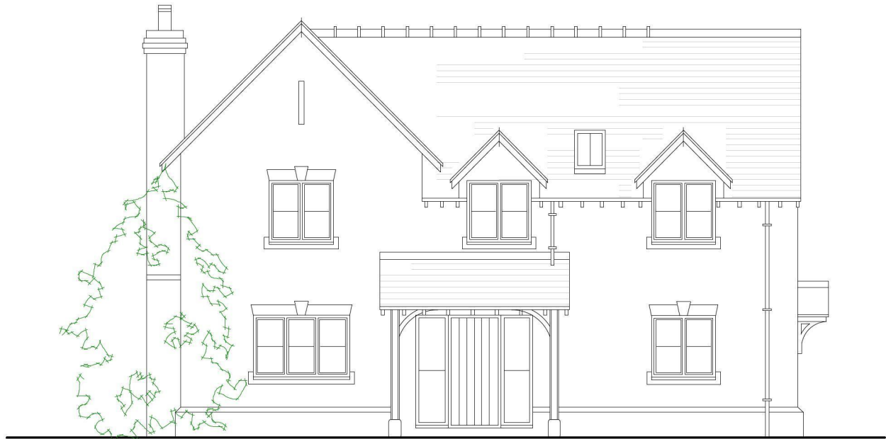
S o u t h e l e v a t i o n