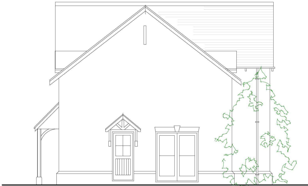
E a s t e l e v a t i o n