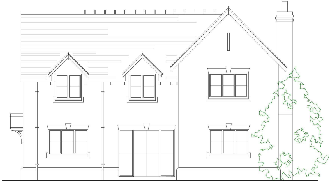
N o r t h e l e v a t i o n