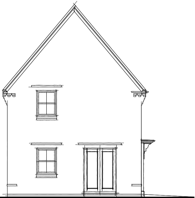
SIDE ELEVATION P341--D5