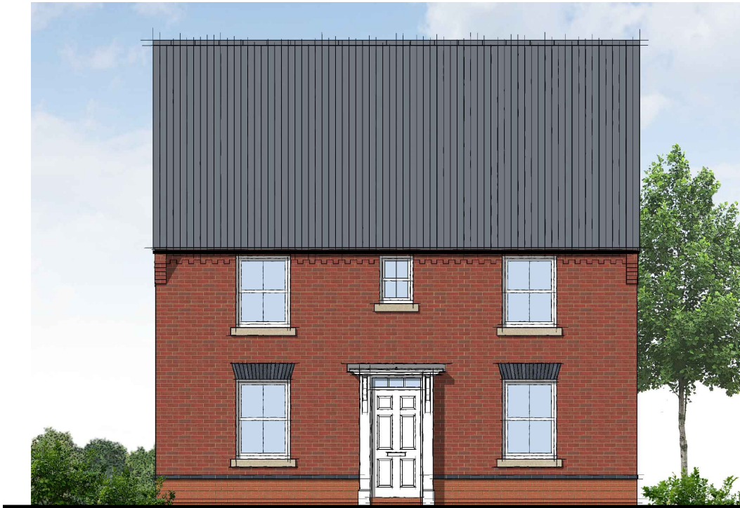
FRONT ELEVATION P341--D5

THIS DRAWING IS COMPLIANT WITH 2010 & 2013 BUILDING REGULATIONS