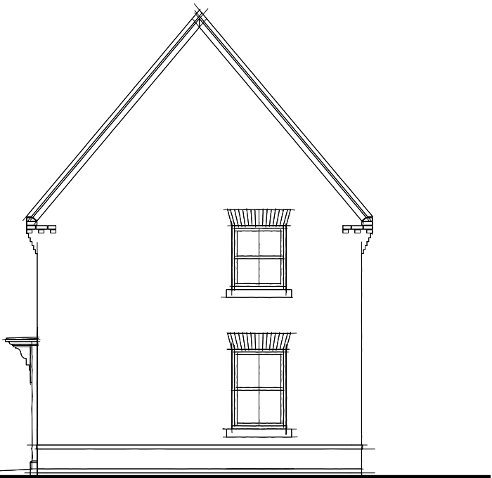
SIDE ELEVATION P341--D5