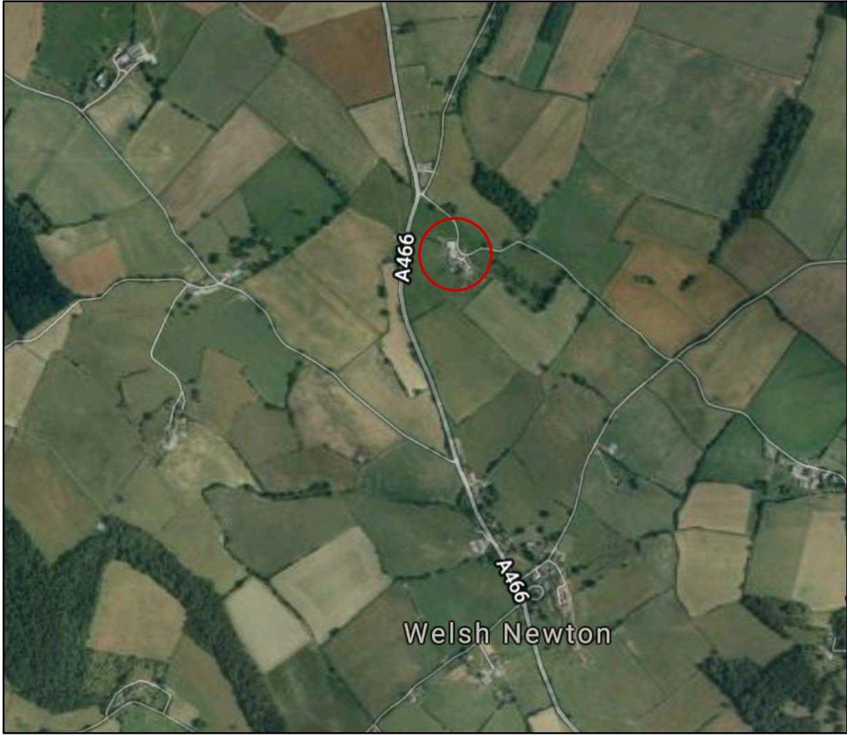
1 Site Location NTS