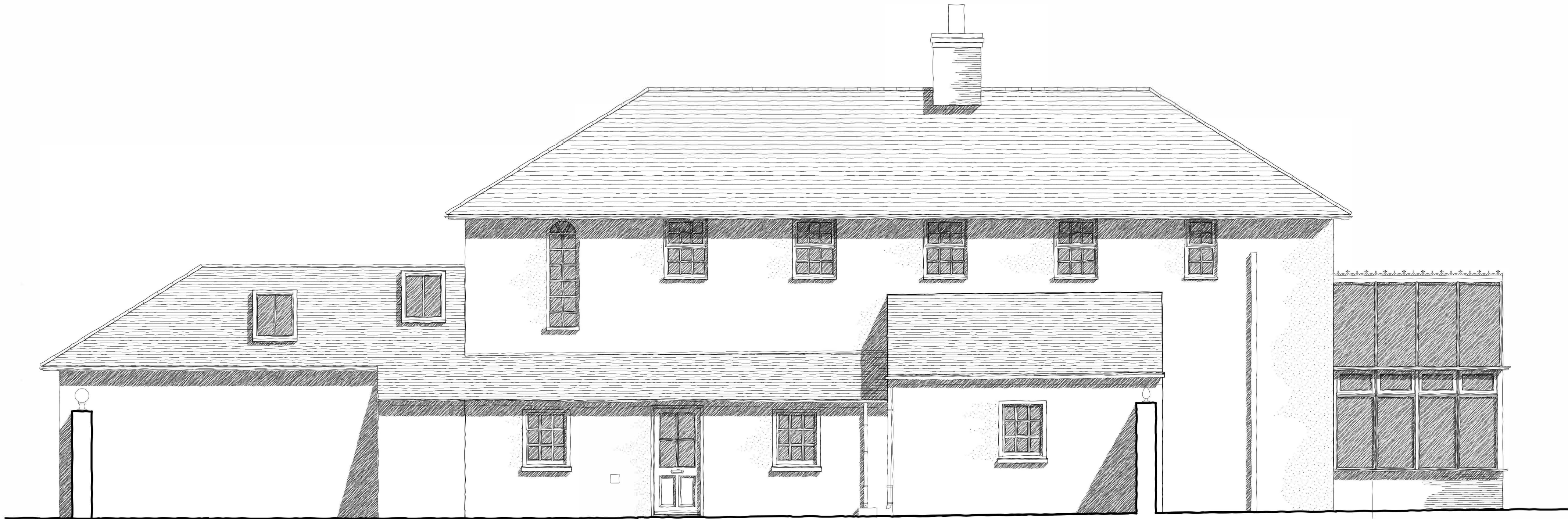
NORTH WEST ELEVATION PROPOSED