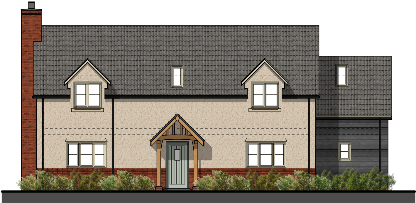
Front Elevation Plot 9