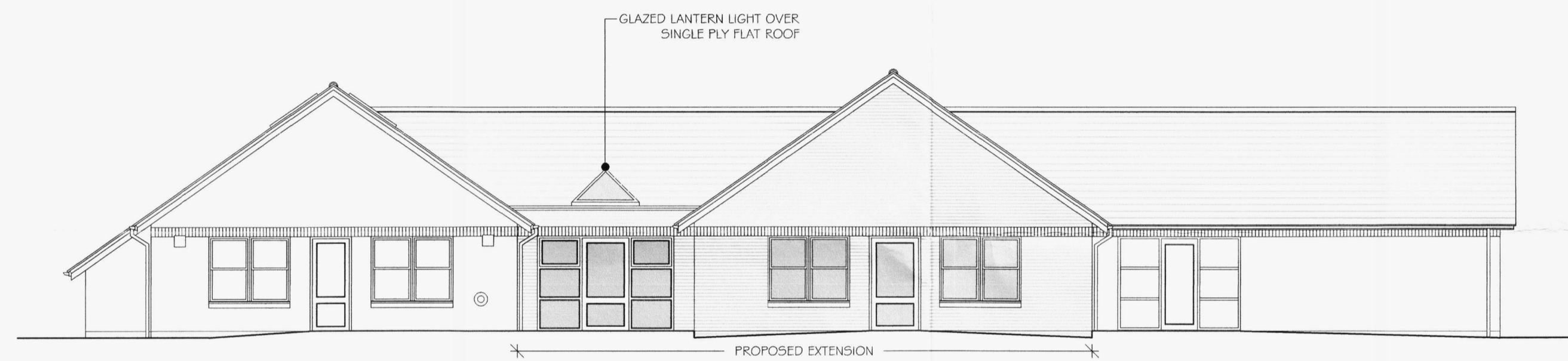
PROPOSED SOUTH EAST ELEVATION (PART)