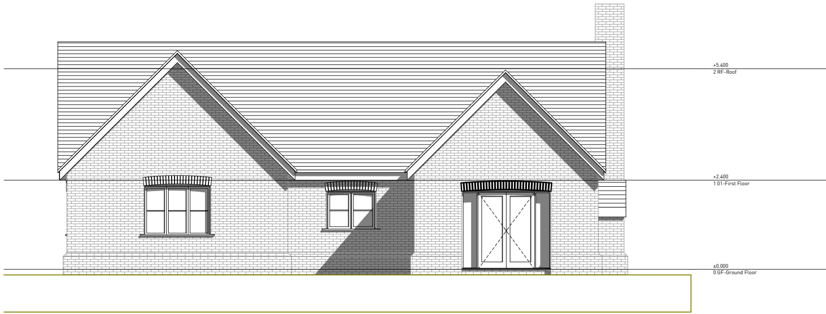
3 Elevation 1:100