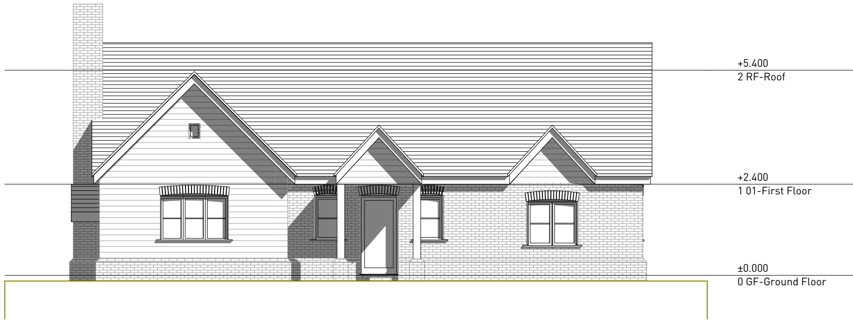
2 Elevation 1:100