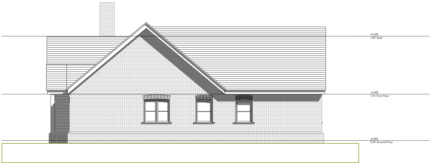
4 Elevation 1:100