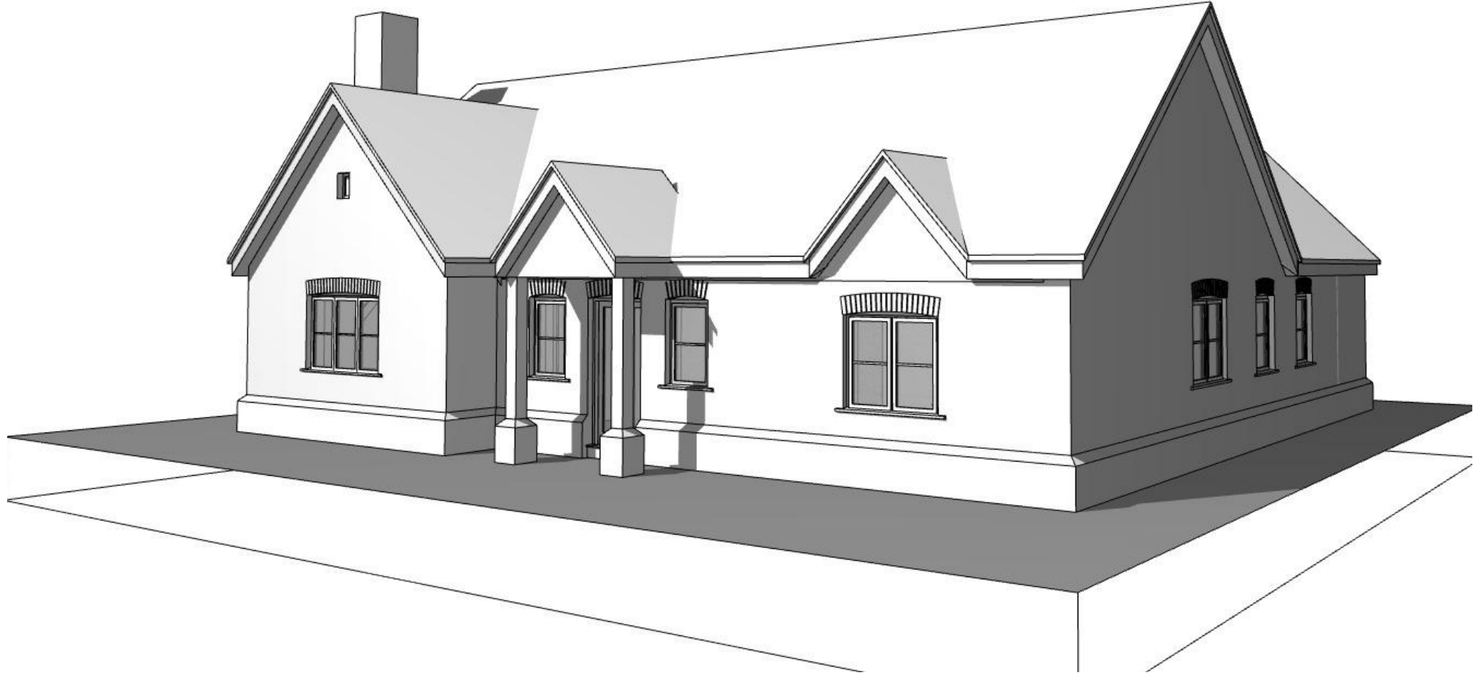
6 Generic Perspective 1:173.61