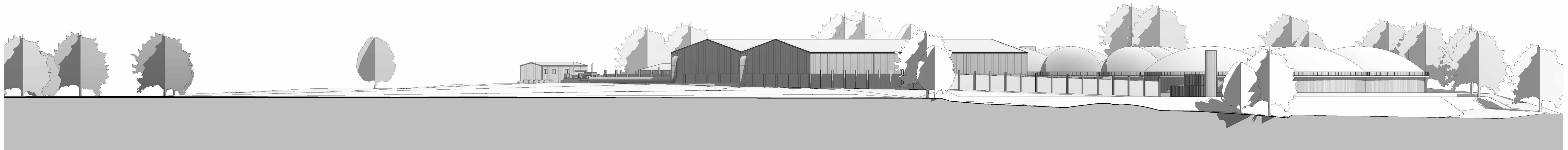
North - Proposed 1 : 500