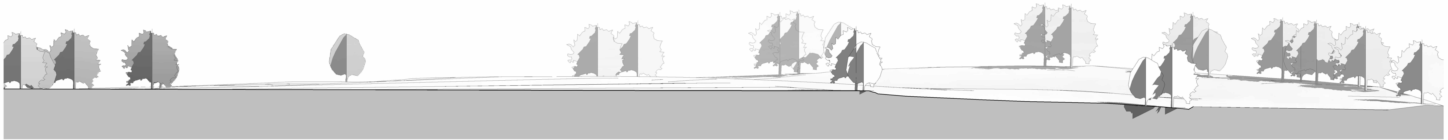
North - Existing 1 : 500