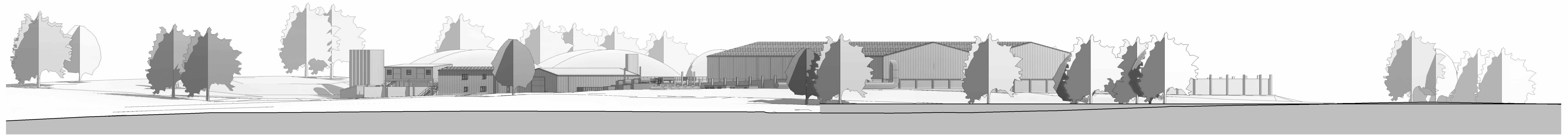
East - Proposed 1 : 500

Only mature trees shown, shrubs, hedgerows and small trees omitted for clarity