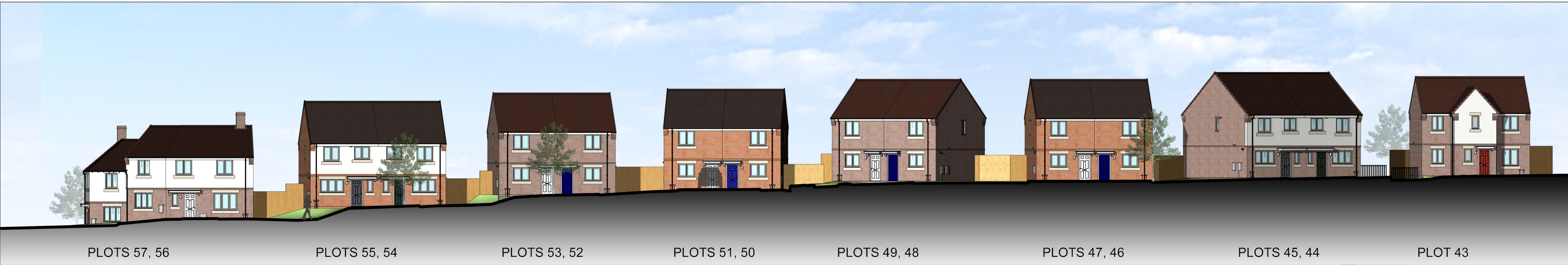
Street Elevation 5-5 1 : 200