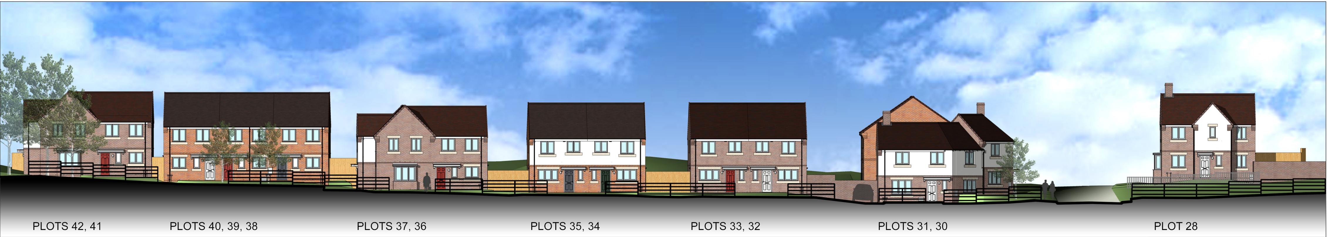
Street Elevation 4-4 1 : 200