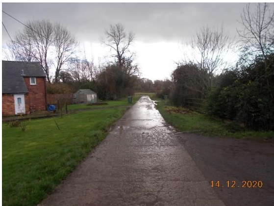
Plate 3: a section of the current farm access road to the south of the site. Photograph taken from the north-west.

Existing Buildings: there are six poultry sheds on the site, all of them operational (see Target Notes 1 and 2 and Plates 4 and 5). There is also a storage shed (see Target Note 3 and Plate 6) and a barn (see Target Note 4 and Plate 7). All of the buildings were judged to have negligible potential to support roosting bats. Some potential bat roosting features were observed in the poultry sheds. However these buildings are fumigated and disinfected at the end of each poultry cycle and thus are totally unsuitable for bats whilst they remain operational (refer also to the section on Bats below). During the development two of the poultry sheds will be extended and four will be demolished and replaced with more efficient sheds.