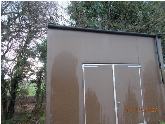
Plate 6: a view of the storage shed (Target Note 3). This building was judged to have negligible potential to support roosting bats. It will remain undamaged and in situ during the project.