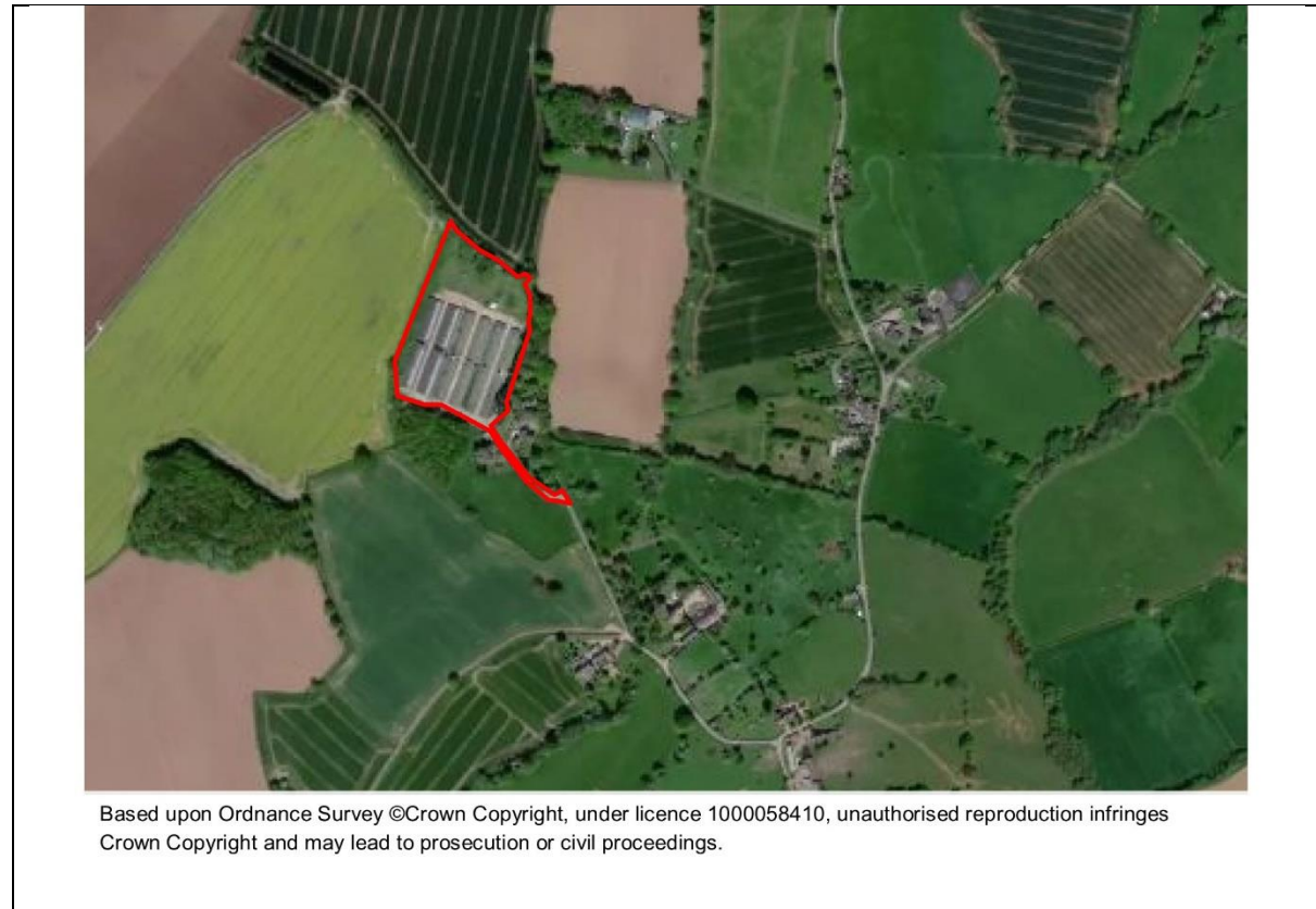
Plate 1: Aerial photograph of the site and surrounding land

It is approximately 2.7 ha in extent and is situated within an agricultural landscape dominated by arable land with small blocks of woodland (see Plate 1). Habitats on and adjacent to the site include buildings, hard standing, bare earth, grassland, hedgerows and plantation woodland. There are no ponds on the site and six ponds within 500m of the site.