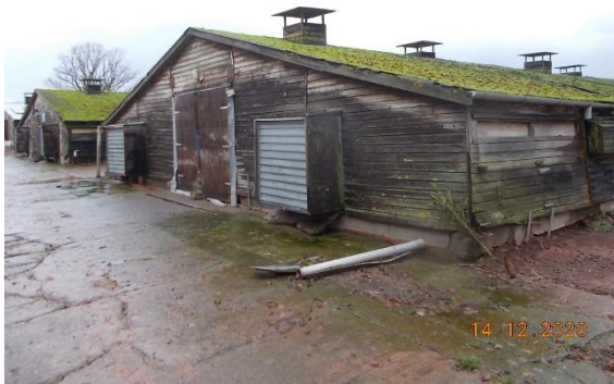
Plate 5: a view of two of the poultry sheds that will be demolished and replaced (Target Note 2). These buildings were judged to have negligible potential to support roosting bats.