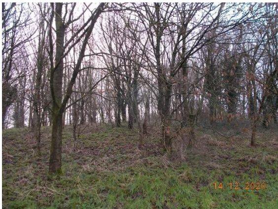
Plate 9: a view of the broad-leaved plantation woodland adjacent to the site's southern boundary (off-site). The trees in the woodland have been judged to have negligible potential to support roosting bats. All of this woodland will remain undamaged and in situ during the project. Photograph taken from the north.

Broad-leaved Plantation Woodland: This habitat is located adjacent to the site's southern boundary (off-site, see Figure 2 and Plates 9 and 10). Plant species recorded in the woodland are shown in Table 1 in Appendix 1. They include only widespread and common species. The trees in the woodland are semi-mature and have been judged to have negligible potential to support roosting bats as no bat roosting features were observed. All of this woodland will remain undamaged and in situ during the project.