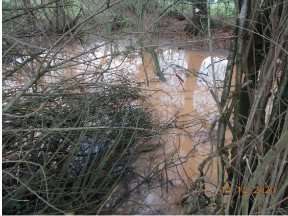
Plate 13 : the pond which is located adjacent to the north-eastern boundary of the site. This pond had large fish present (several were observed alive and one dead) and was assessed to have ‘poor’ habitat suitability for great crested newts, mainly because of the presence of fish.

Ponds : There are no ponds on the site and six ponds within 500m of the site. Five of the ponds were not accessible during the survey. The one accessible pond (adjacent to the site, see Plate 13) was assessed to have ‘poor’ habitat suitability for great crested newts (refer also to the Great Crested Newts section below and Table 5 in Appendix 1 for details of the survey results).