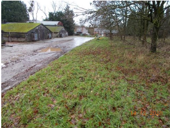
Plate 8: a view of the narrow semi-improved grassland margin on the site's southern boundary. Photograph taken from the west.

Broad-leaved Plantation Woodland: This habitat is located adjacent to the site's southern boundary (off-site, see Figure 2 and Plates 9 and 10). Plant species recorded in the woodland are shown in Table 1 in Appendix 1. They include only widespread and common species. The trees in the woodland are semi-mature and have been judged to have negligible potential to support roosting bats as no bat roosting features were observed. All of this woodland will remain undamaged and in situ during the project.