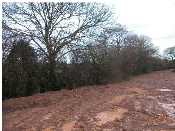
Plate 11: a view of the hedgerow on the site’s northern boundary. Photograph taken from the west. This hedgerow has been assessed according to the Hedgerows Regulations, 1997 as ‘not important’. It has also been judged to have negligible potential to support roosting bats. All of this hedgerow will remain undamaged and in situ during the project.

and 2-4m in width at the base, with a 2m high earth bank in the west, and a ditch in the north (off-site). The woody species present in this hedge include alder, ash, blackthorn, elder, grey willow, hawthorn, holly and pedunculate oak. Plant species recorded in the hedge are shown in Table 1 in Appendix 1 under the column heading ‘Hedgerow 1’. They include only widespread and common species. This hedge has been assessed as ‘not important’ according to the Hedgerows Regulations, 1997 (see Table 2 in Appendix 1). It has been judged to have negligible potential to support roosting bats as no bat roosting features were observed. All of this hedgerow will remain undamaged and in situ during the project.