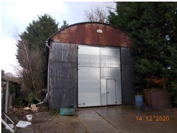
Plate 7: a view of the barn (Target Note 4). This building was judged to have negligible potential to support roosting bats. It will remain undamaged and in situ during the project.

Semi-improved Grassland: This habitat is present as narrow margins on the site's southern and south-eastern boundaries (see Figure 2 and Plate 8). Plant species recorded in the grassland are shown in Table 1 in Appendix 1. They include only widespread and common species.