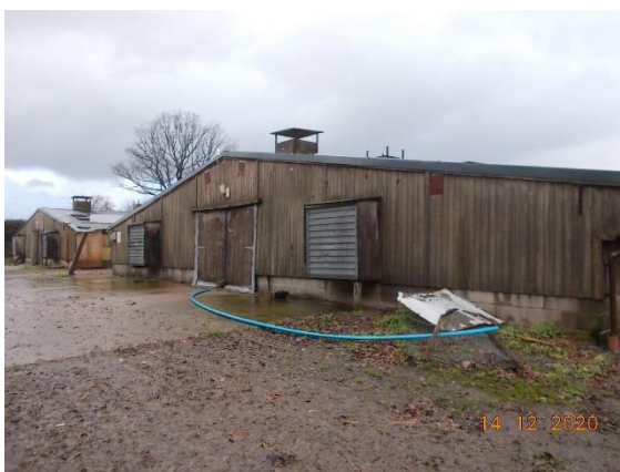
Plate 4: a view of the two poultry sheds which will be extended (Target Note 1). These buildings were judged to have negligible potential to support roosting bats.

Existing Buildings: there are six poultry sheds on the site, all of them operational (see Target Notes 1 and 2 and Plates 4 and 5). There is also a storage shed (see Target Note 3 and Plate 6) and a barn (see Target Note 4 and Plate 7). All of the buildings were judged to have negligible potential to support roosting bats. Some potential bat roosting features were observed in the poultry sheds. However these buildings are fumigated and disinfected at the end of each poultry cycle and thus are totally unsuitable for bats whilst they remain operational (refer also to the section on Bats below). During the development two of the poultry sheds will be extended and four will be demolished and replaced with more efficient sheds.