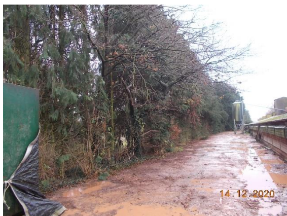
Plate 12: a view of the hedgerow on the site’s eastern boundary. Photograph taken from the north. This hedgerow has been assessed according to the Hedgerows Regulations, 1997 as ‘not important’. It has also been judged to have negligible potential to support roosting bats. All of this hedgerow will remain undamaged and in situ during the project.

Species-poor Hedge and Trees: This hedgerow is found on the site’s eastern boundary (see Figure 2 and Plate 12). The hedgerow is approximately 16m in height and 2-4m in width at the base. The woody species present in this hedge include elder, Leyland cypress and pedunculate oak. Plant species recorded in the hedge are shown in Table 1 in Appendix 1 under the column heading ‘Hedgerow 2’. They include only widespread and common species. This hedge has been assessed as ‘not important’ according to the Hedgerows Regulations, 1997 (see Table 3 in Appendix 1). It has been judged to have negligible potential to support roosting bats as no bat roosting features were observed. All of this hedgerow will remain undamaged and in situ during the project.