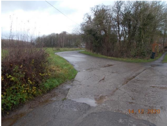
Plate 2: the junction of the existing farm access road with the highway. Photograph taken from the south-east.