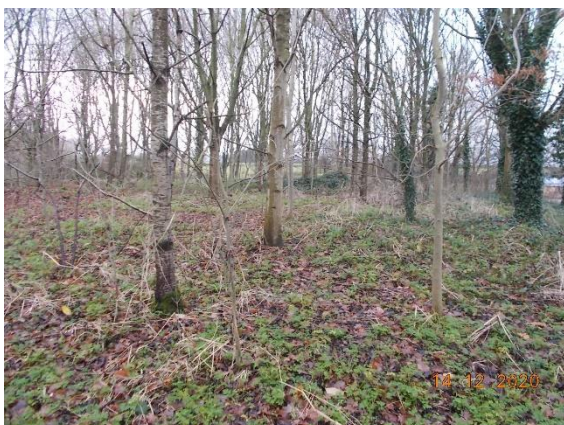
Plate 10: a view of the interior of the adjacent woodland.

Native Species-rich Hedge and Trees: This hedgerow is found on the site's western and northern boundaries (see Figure 2 and Plate 11). The hedgerow is approximately 2-6m in height