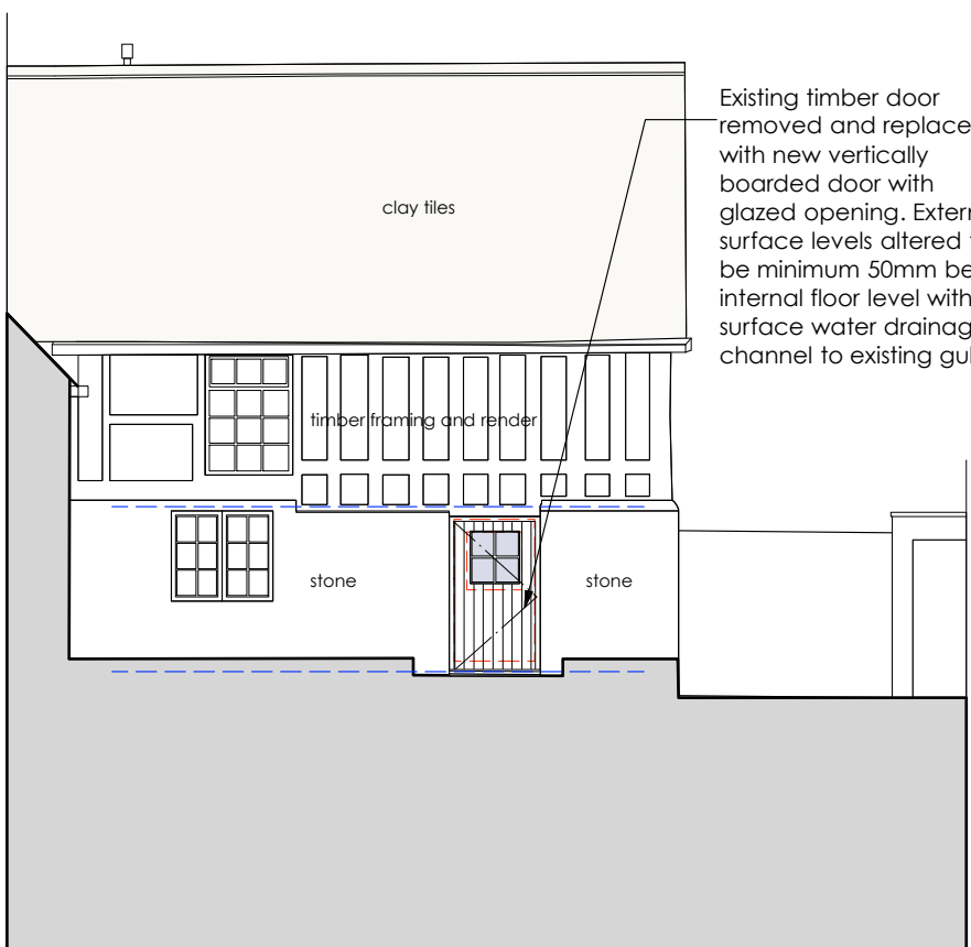
EAST ELEVATION (COURTYARD)