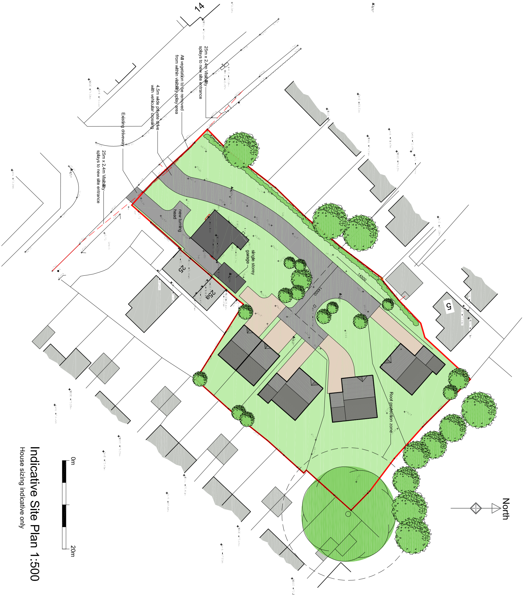
Indicative Site Plan 1:500 House sizing indicative only