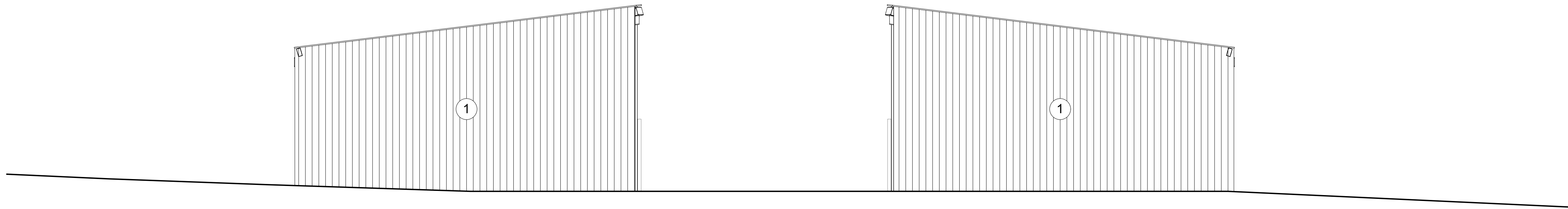
1 South Elevation Scale: 1:50