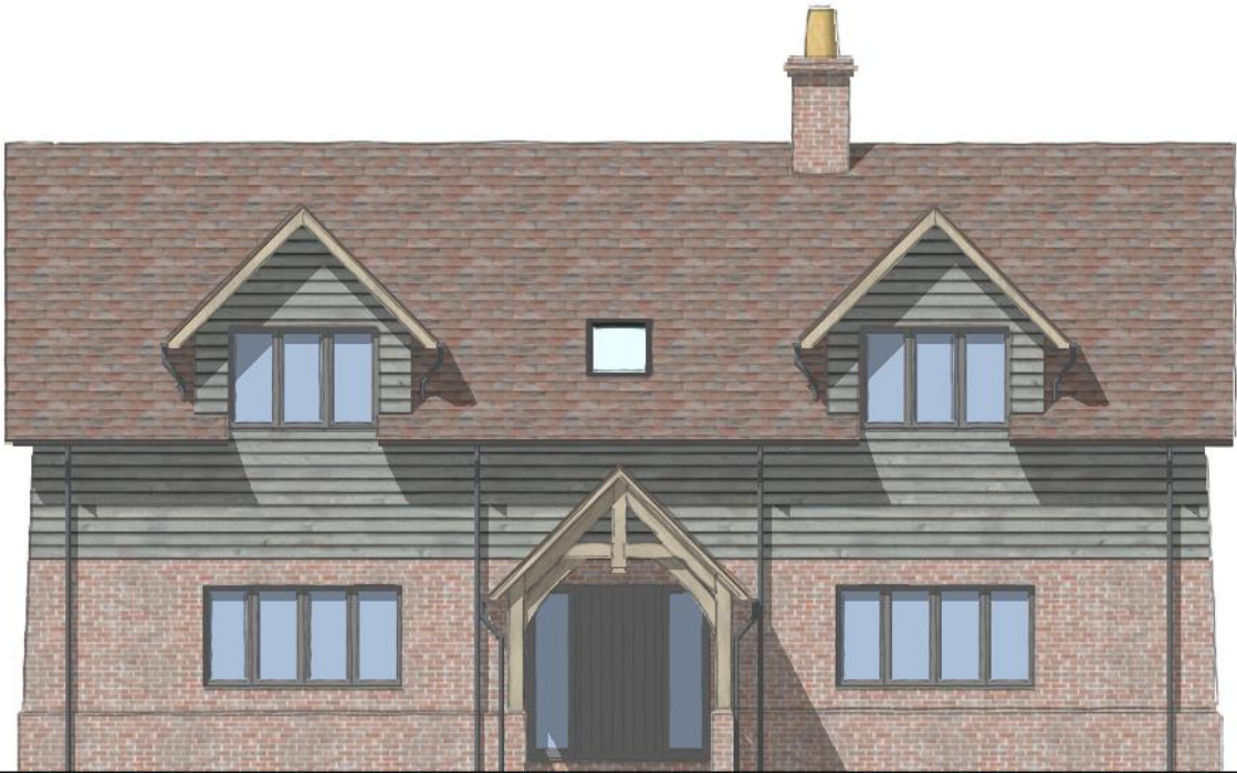
WEST ELEVATION Scale 1:100