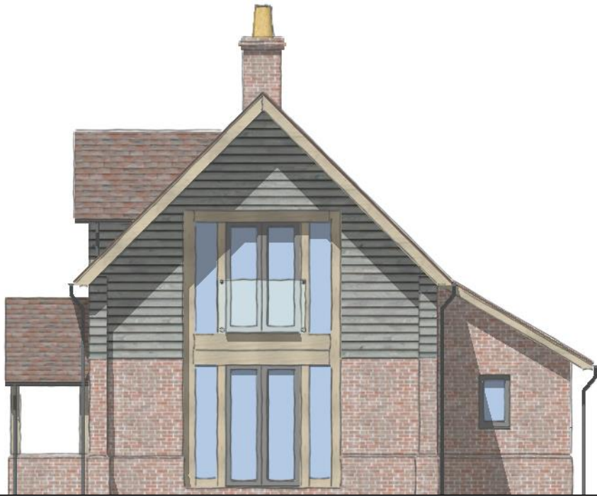
SOUTH ELEVATION Scale 1:100