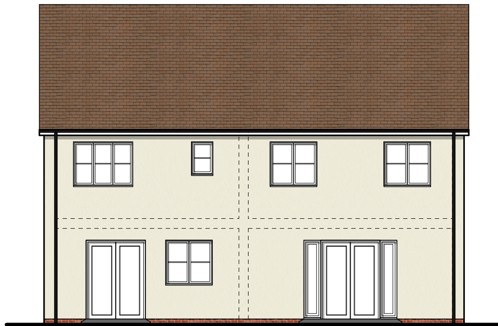
Plot 3 Rear Elevation