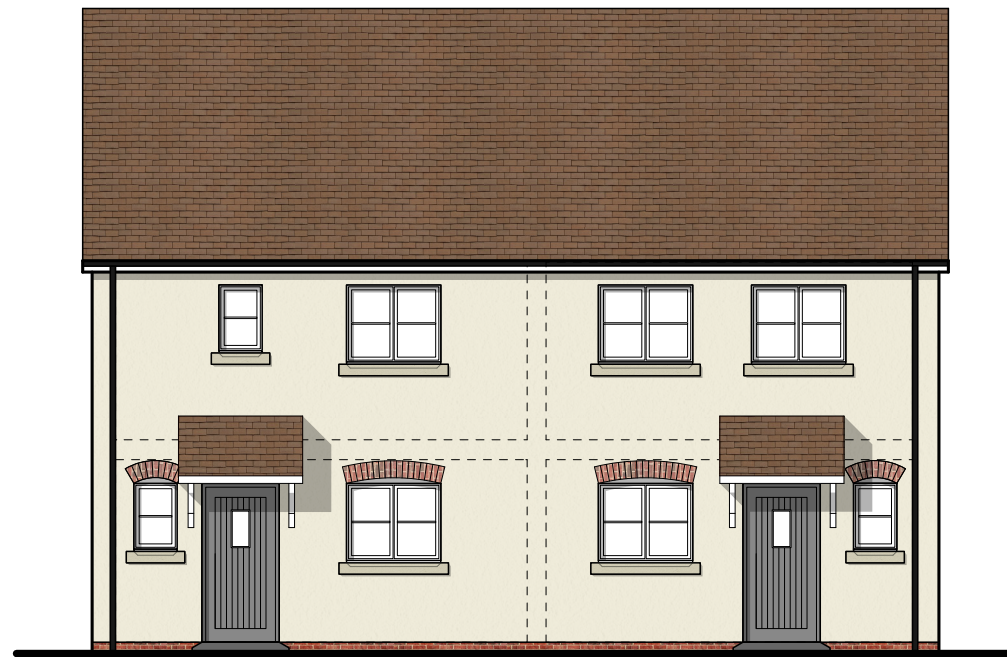
Plot 2 Front Elevation