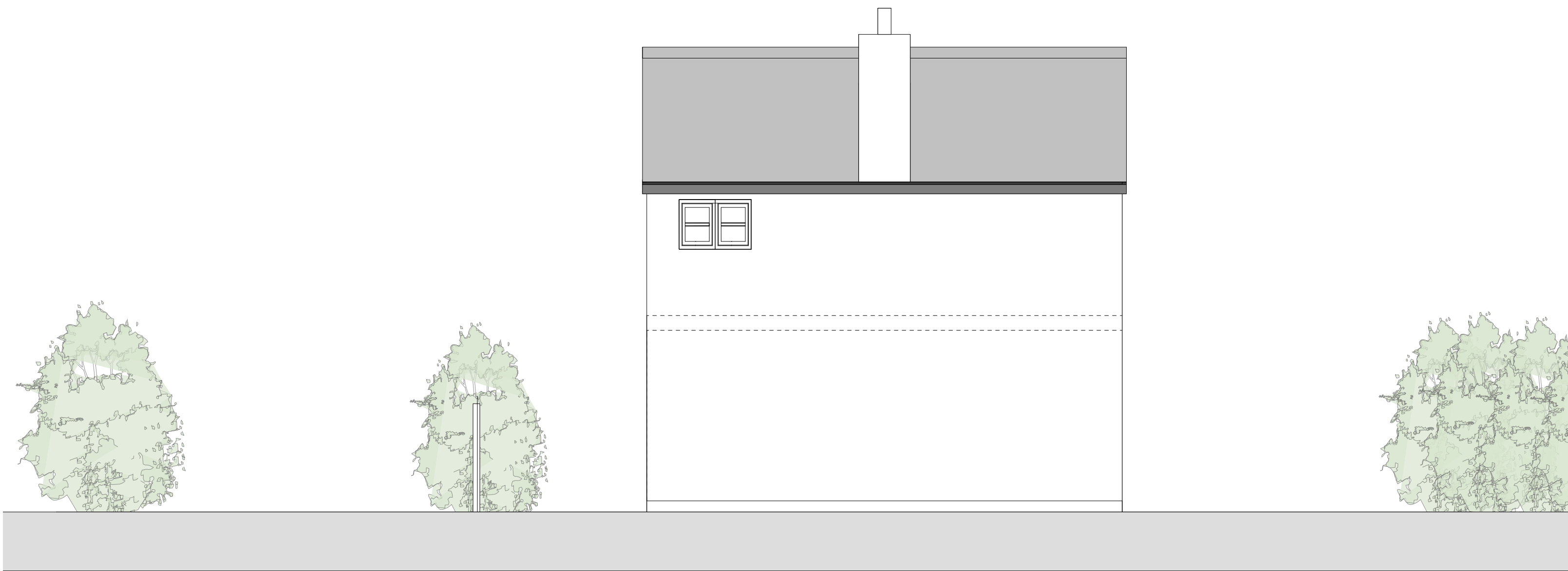
6 NORTH ELEVATION 1:50 @ A1, 1:100 @ A3