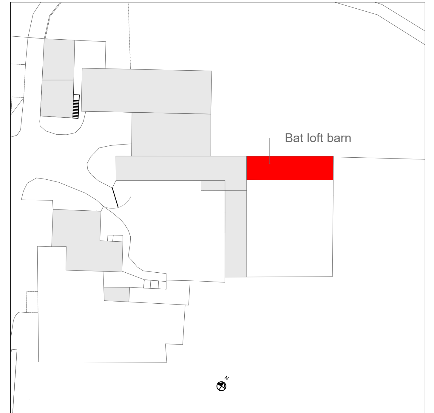
-3. Bat loft 1:500

General Notes: Type 1 bituminous felt to be used and untreated roof timber used in construction of Bat lofts. Floors, walls and soffit of Bat lofts shall be insulated and boarded