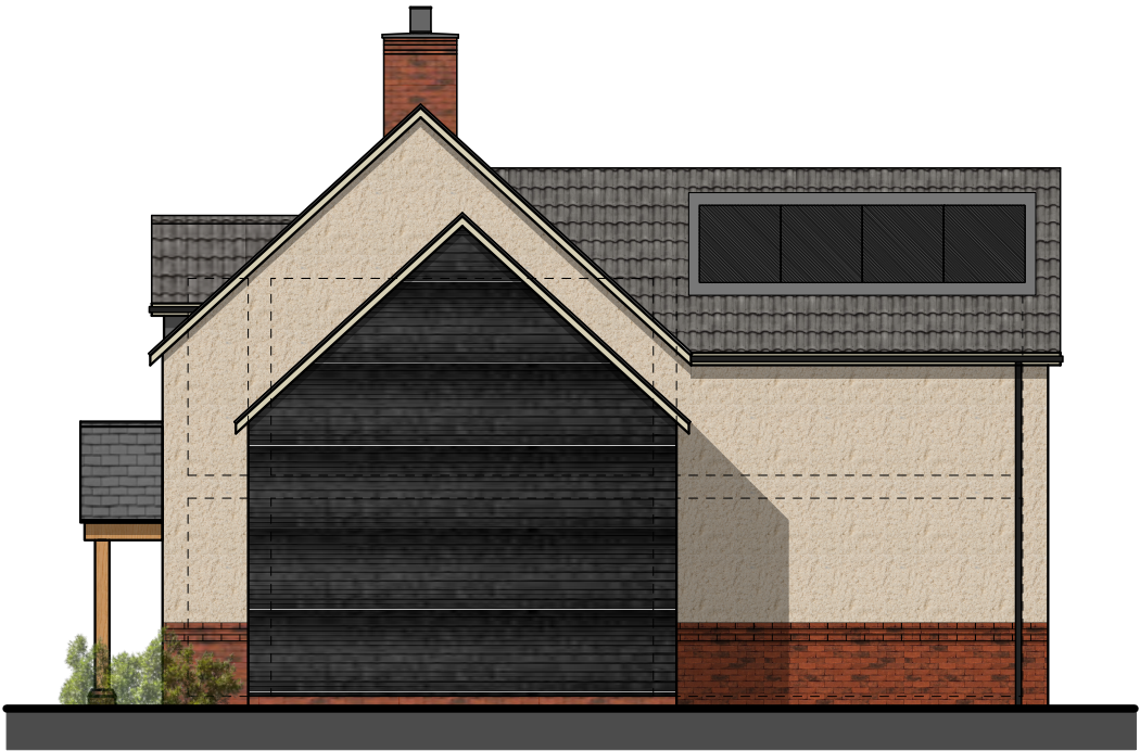
Side Elevation Plot 8