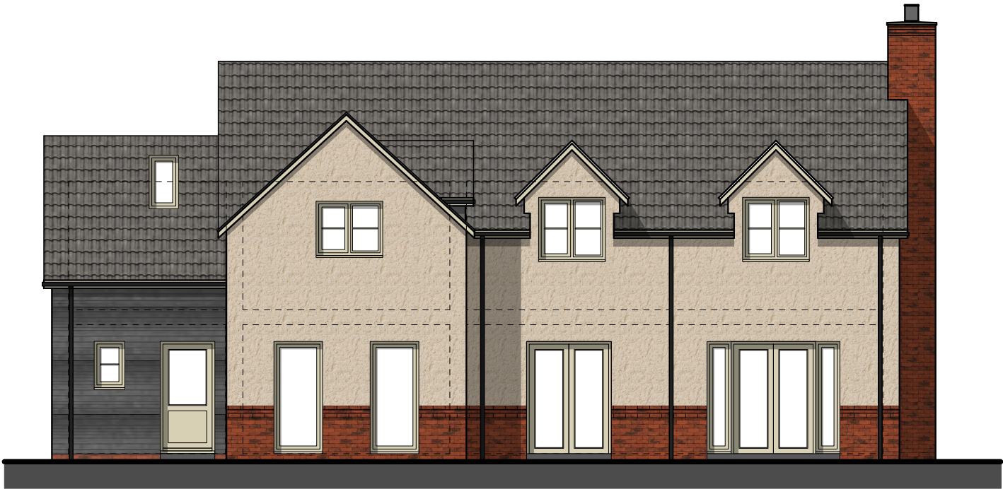
Rear Elevation Plot 8