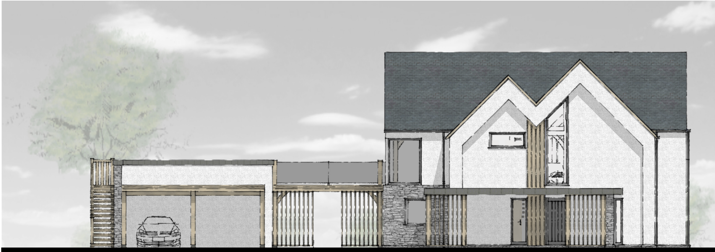
FRONT (EAST) ELEVATION Proposed Scale 1:100