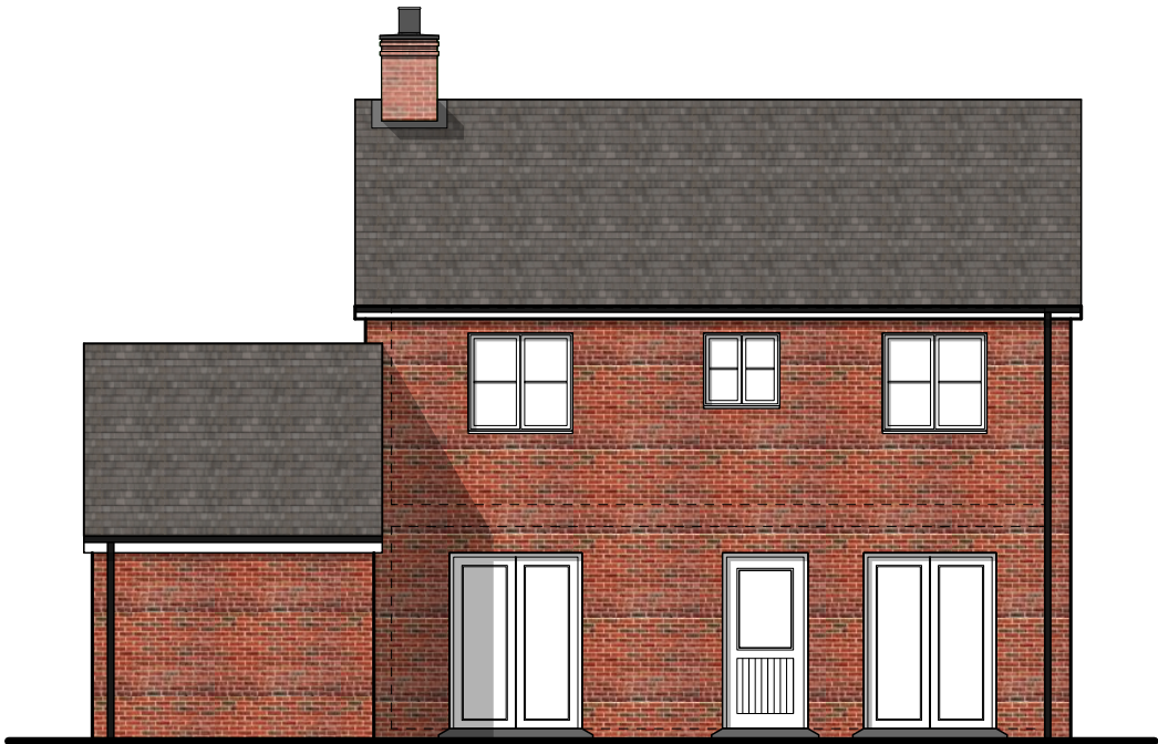
Plot 37 Garage Rear Elevation