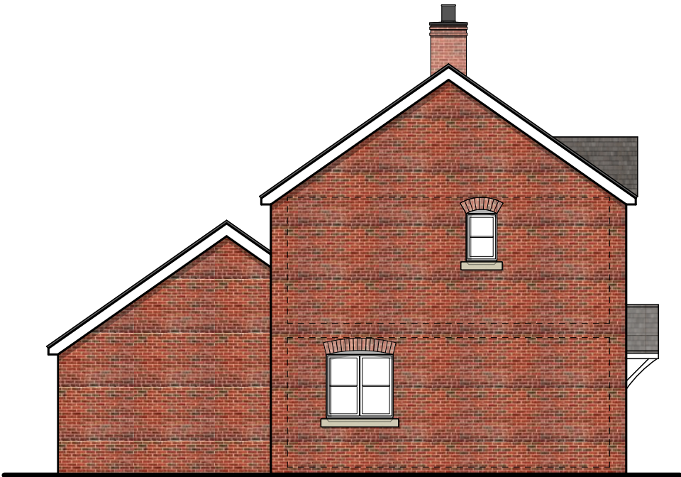
Plot 37 Side Elevation