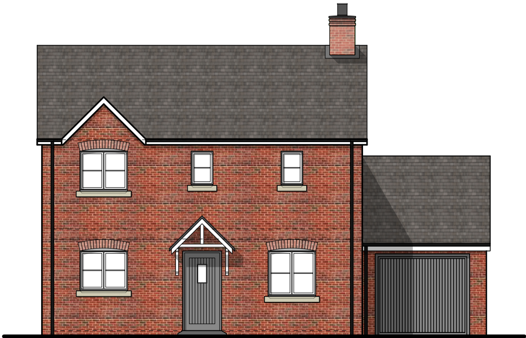
Plot 37 Front Elevation

~: 18.08.21 - BWb - RJF: Drawing created. A: 15.09.21 - BWb - RJF: Windows added to gable elevation.