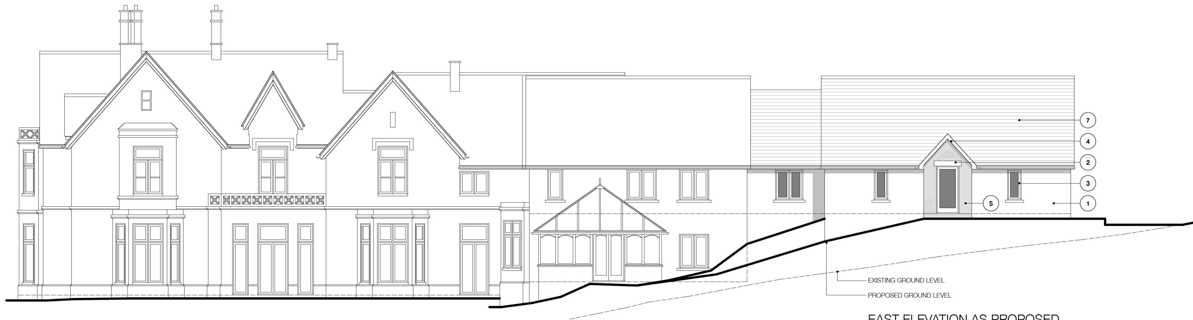
EAST ELEVATION AS PROPOSED