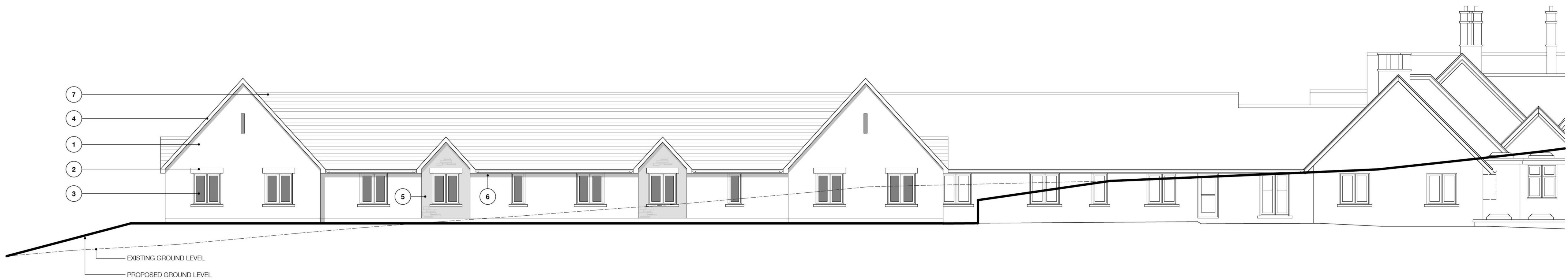
NORTH ELEVATION AS PROPOSED