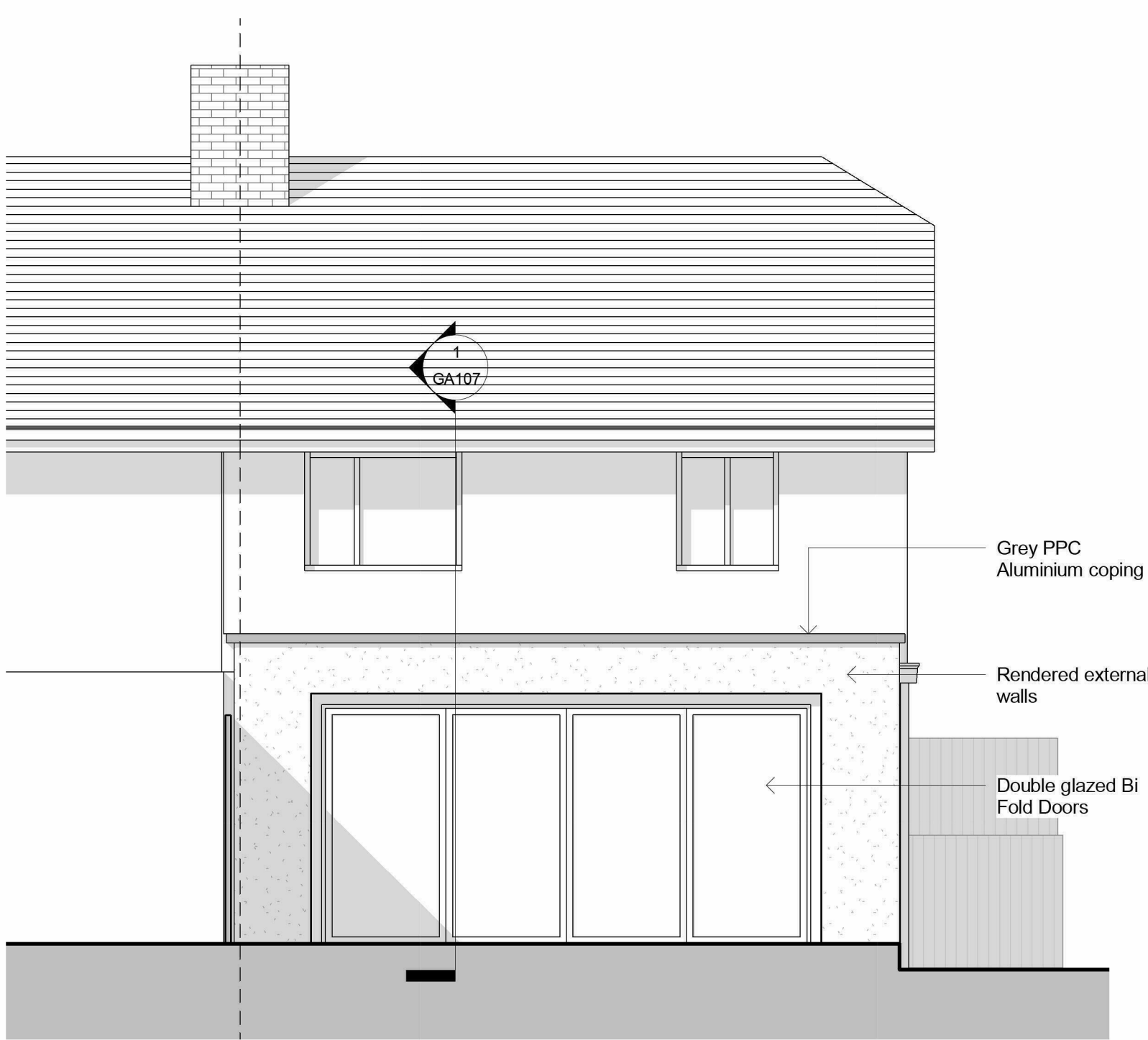
3 Proposed South Elevation 1 : 50

NO WORKS ARE BEING CARRIED OUT ON THIS ELEVATION FACING THE STREET