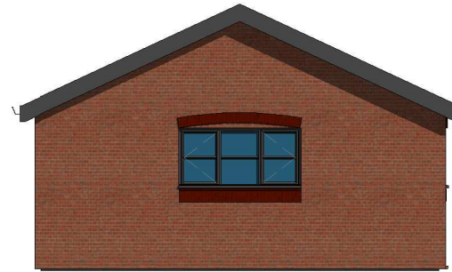
6 West Elevation 1 : 100