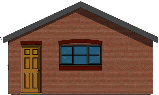
4 East Elevation 1 : 100