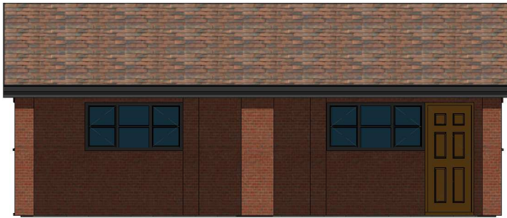
3 North Elevation 1 : 100