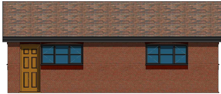
5 South Elevation 1 : 100