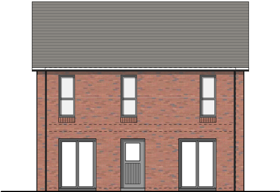
Rear Elevation Plot 21