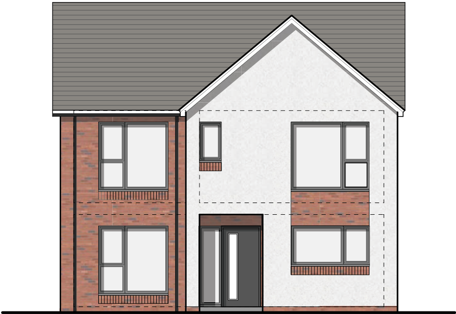
Front Elevation Plot 21