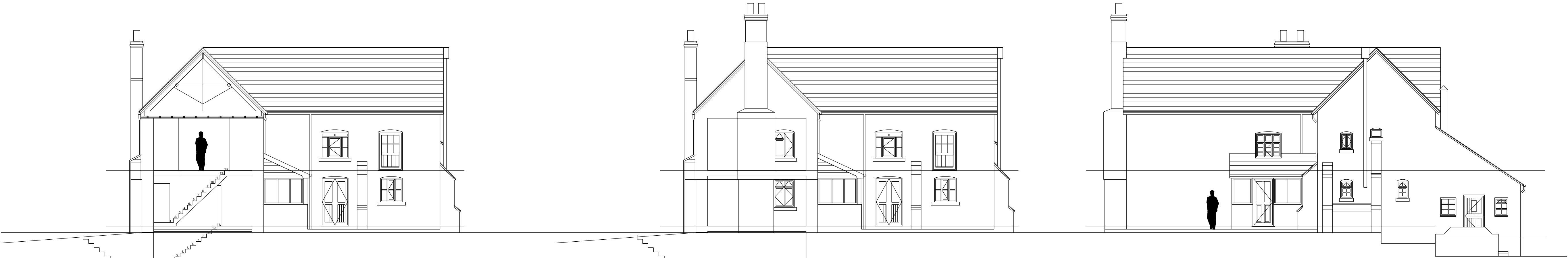
Section - A