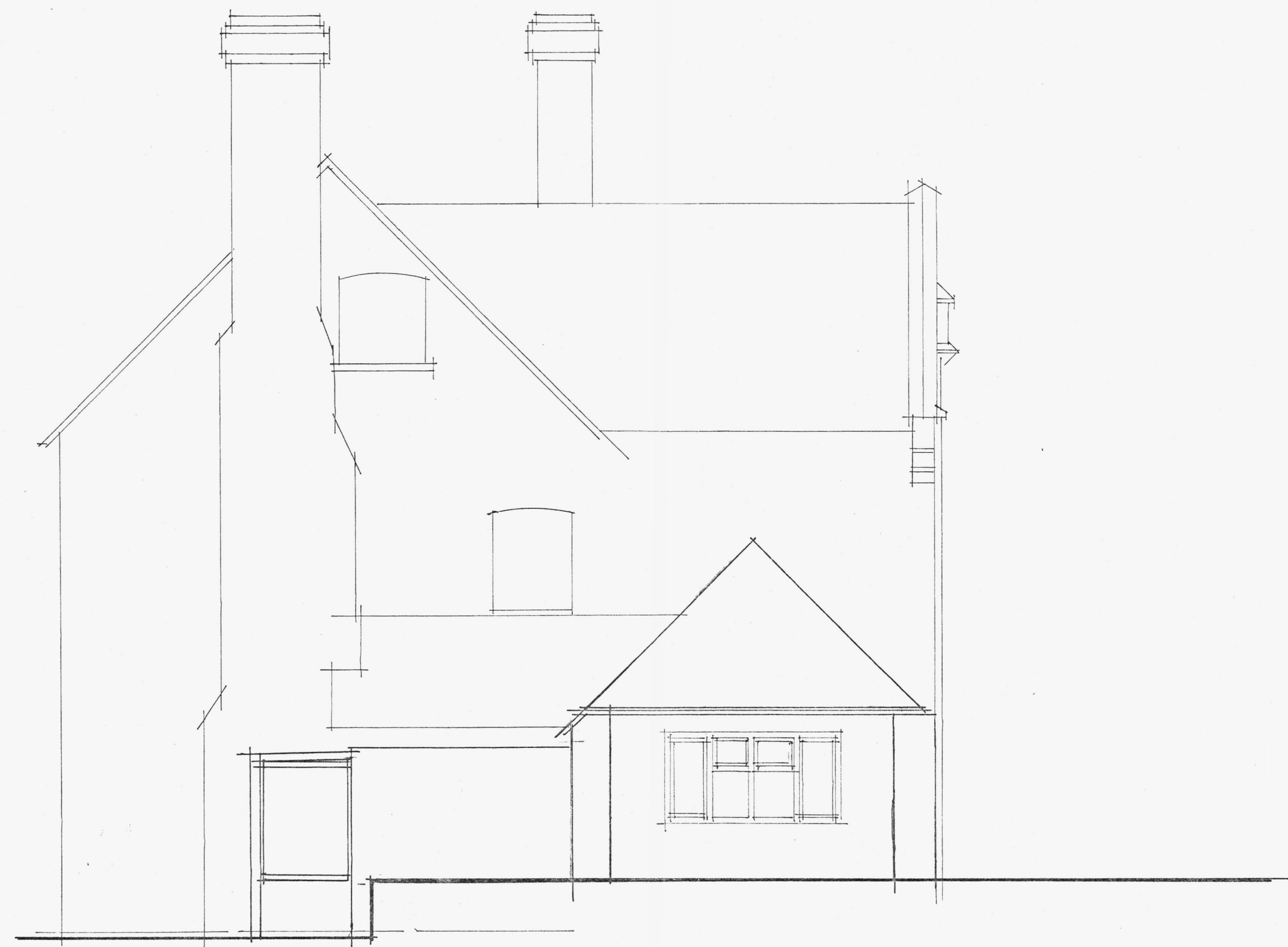
existing north east