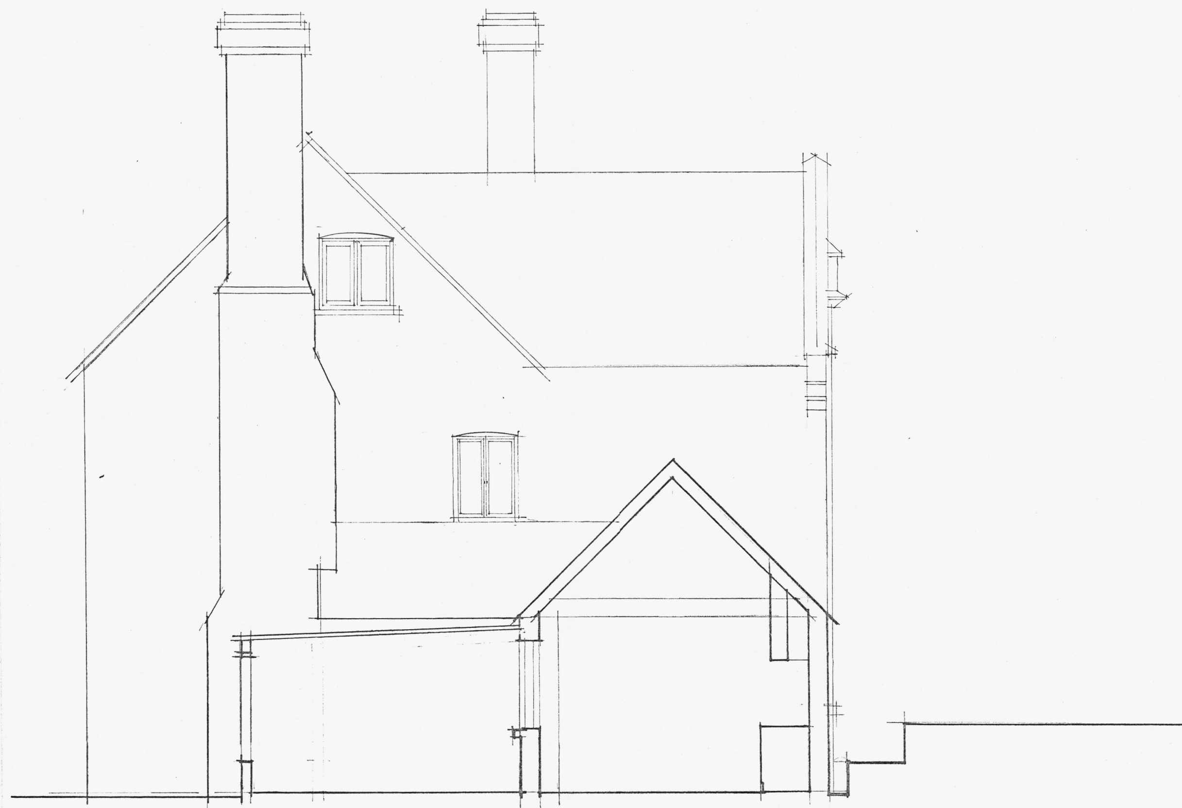
existing north east/section