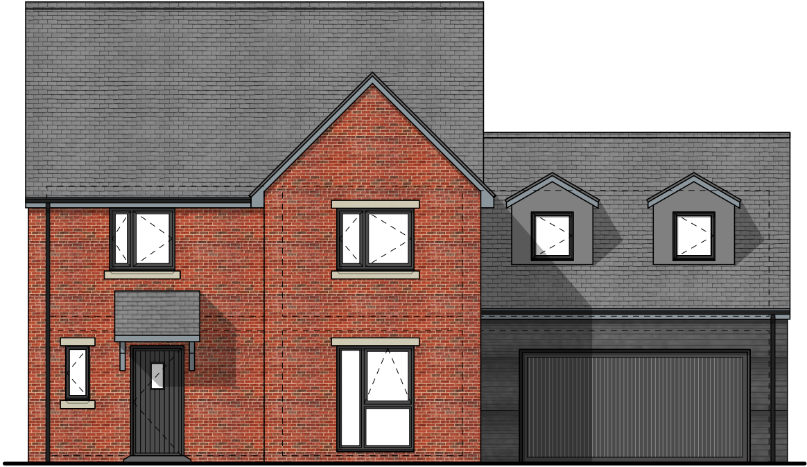
Plot 4 Front Elevation