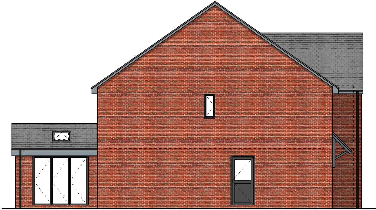
Plot 4 Side Elevation