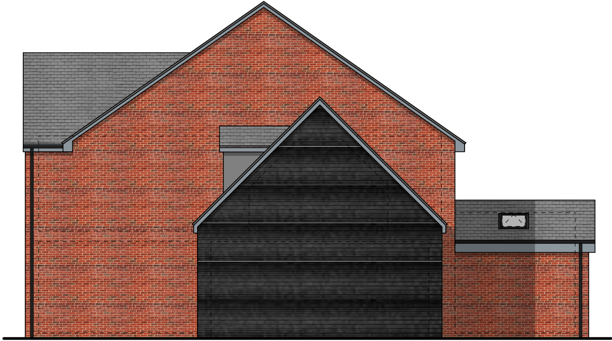
Plot 4 Side Elevation