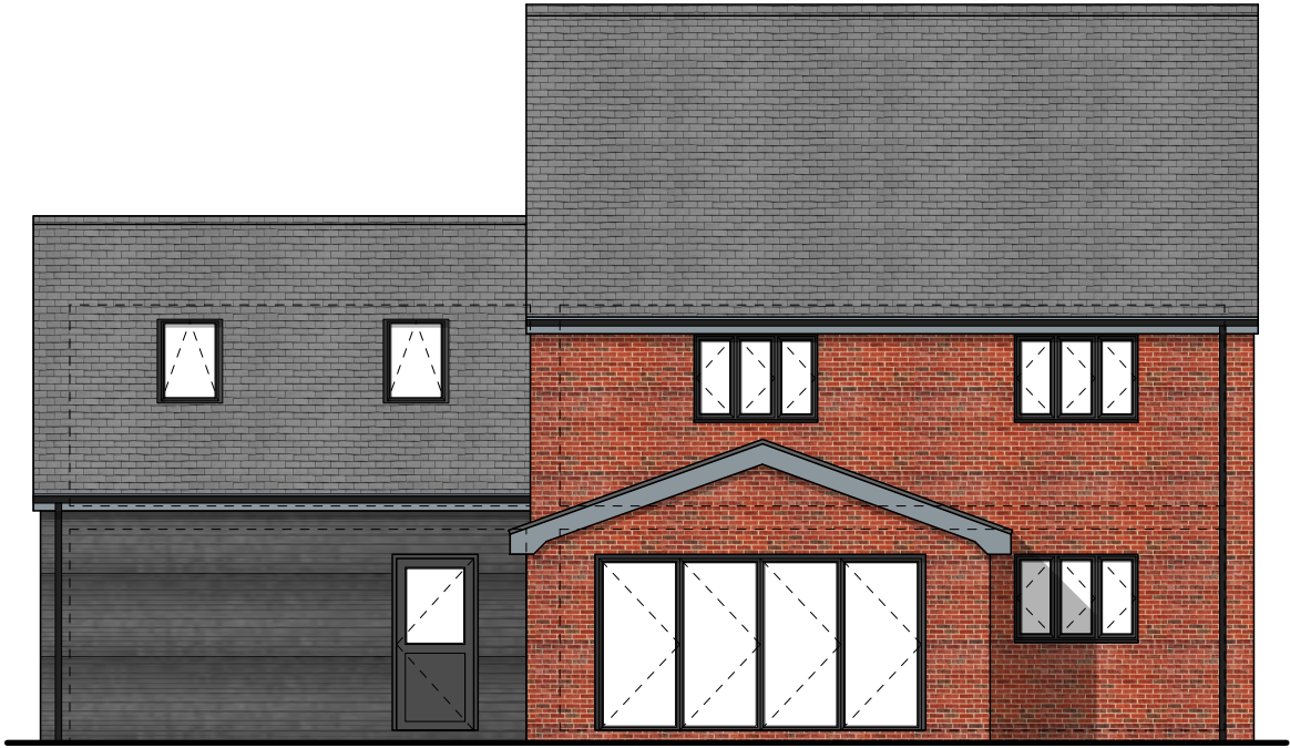
Plot 4 Rear Elevation