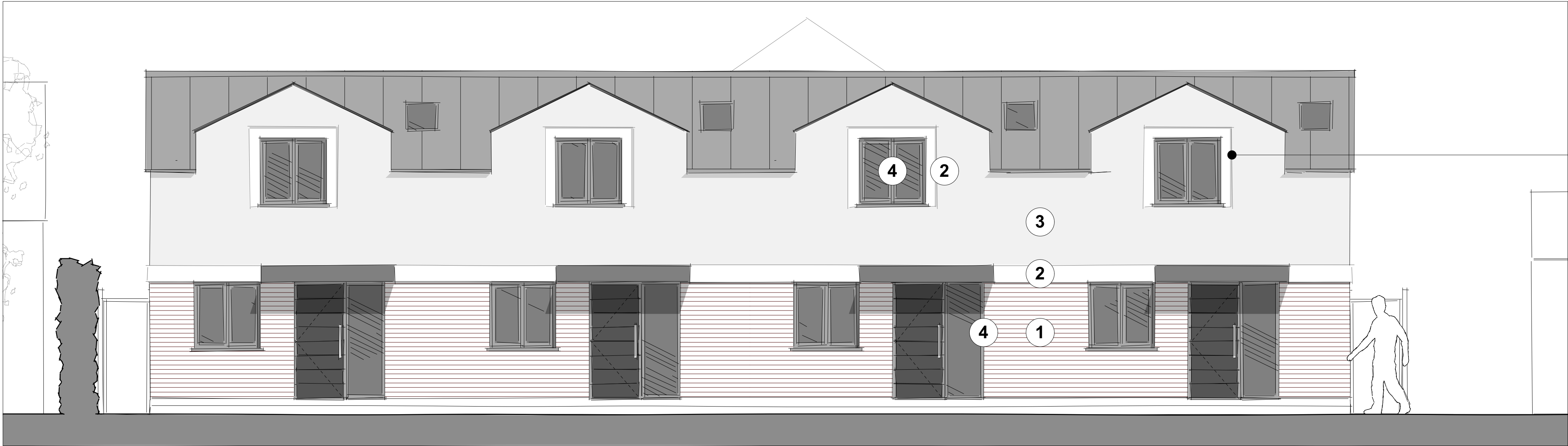
1 WEST ELEVATION (FRONT) 1:50 @ A1 / 1:100 @ A3