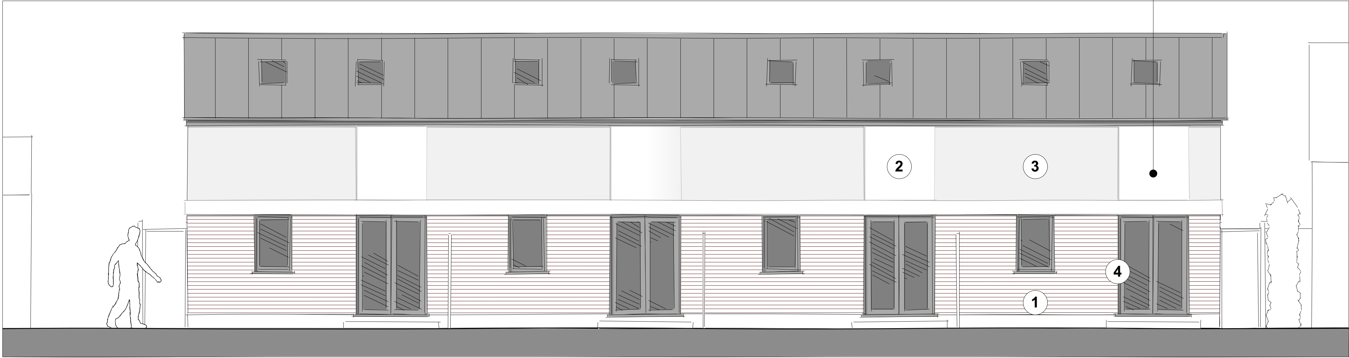
2 EAST ELEVATION (REAR) 1:50 @ A1 / 1:100 @ A3