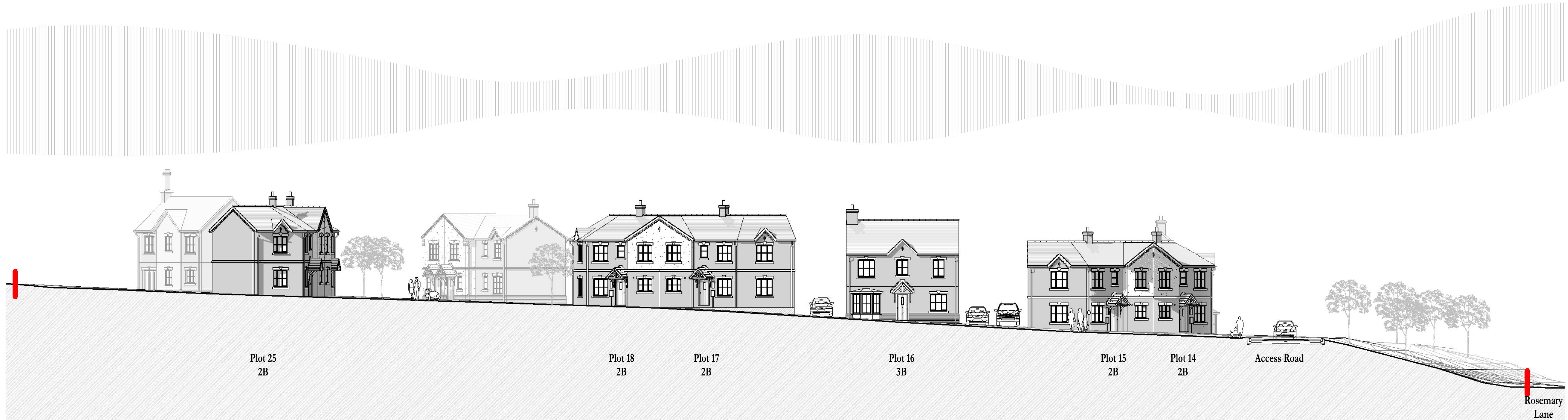
Proposed Street Scene Elevation 'B'