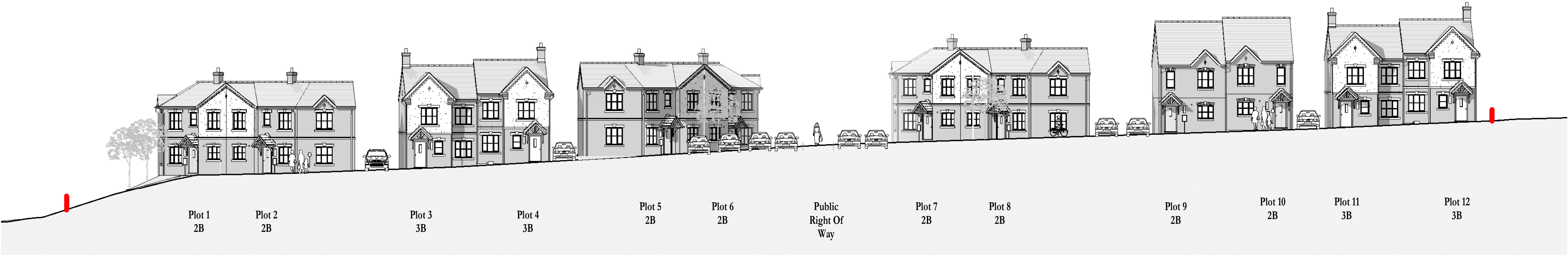
Proposed Street Scene Elevation 'A'