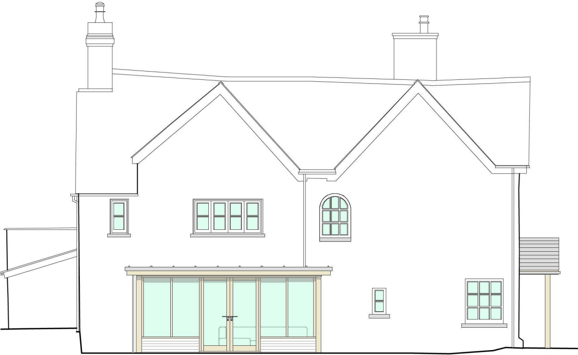
3 SOUTH ELEVATION SCALE - 1:100