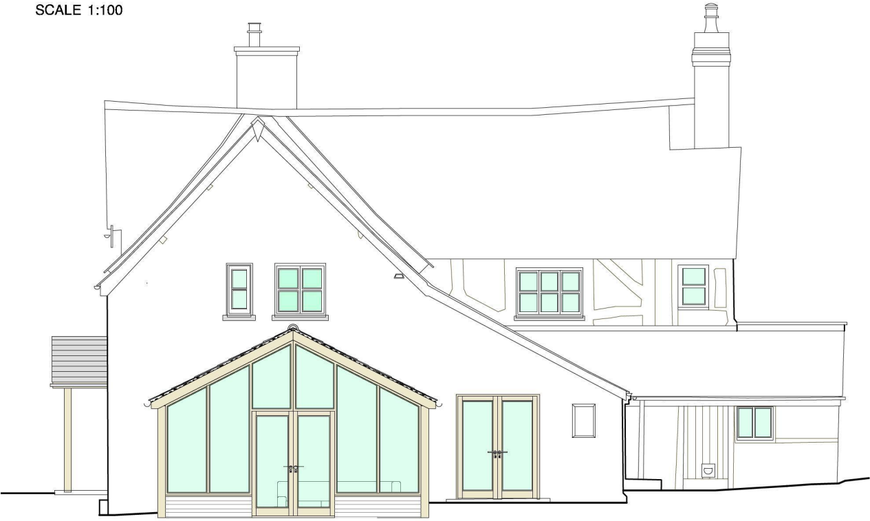
1 NORTH ELEVATION SCALE - 1:100