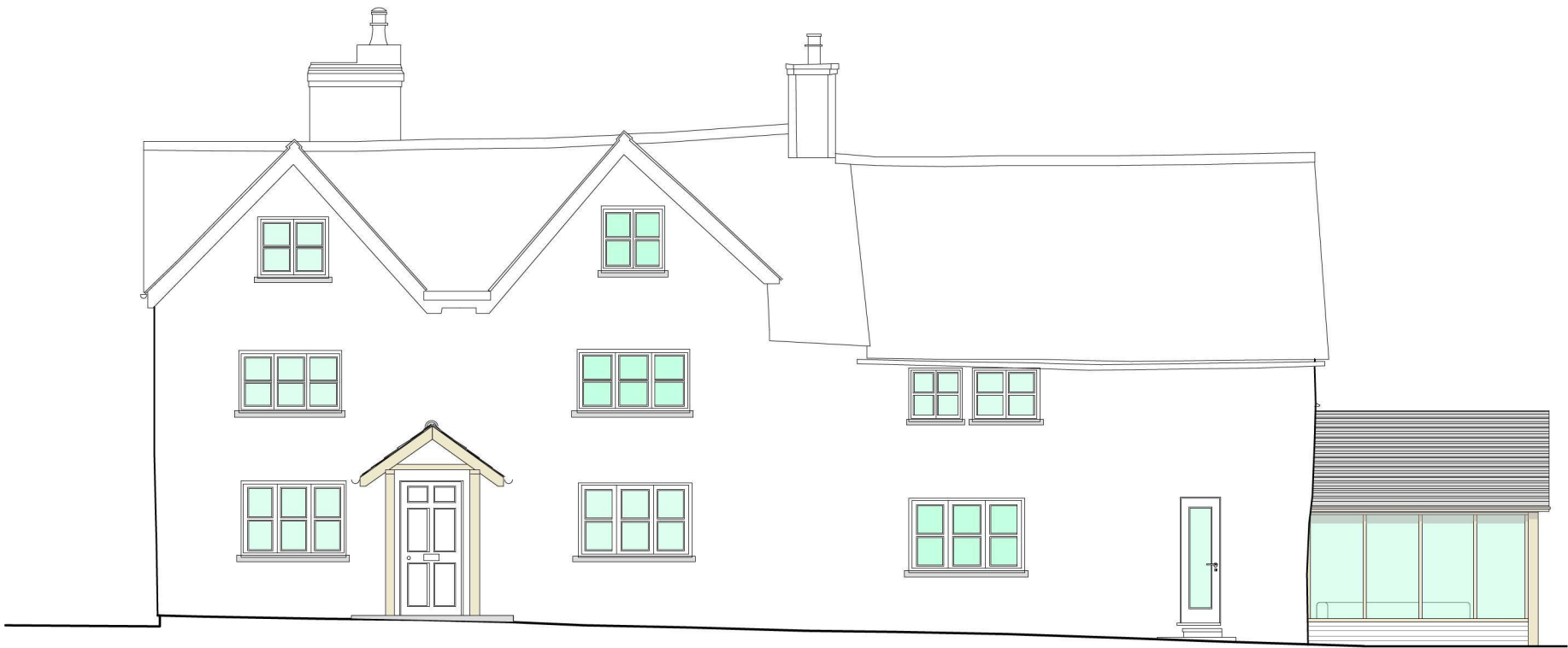
2 EAST ELEVATION SCALE - 1:100