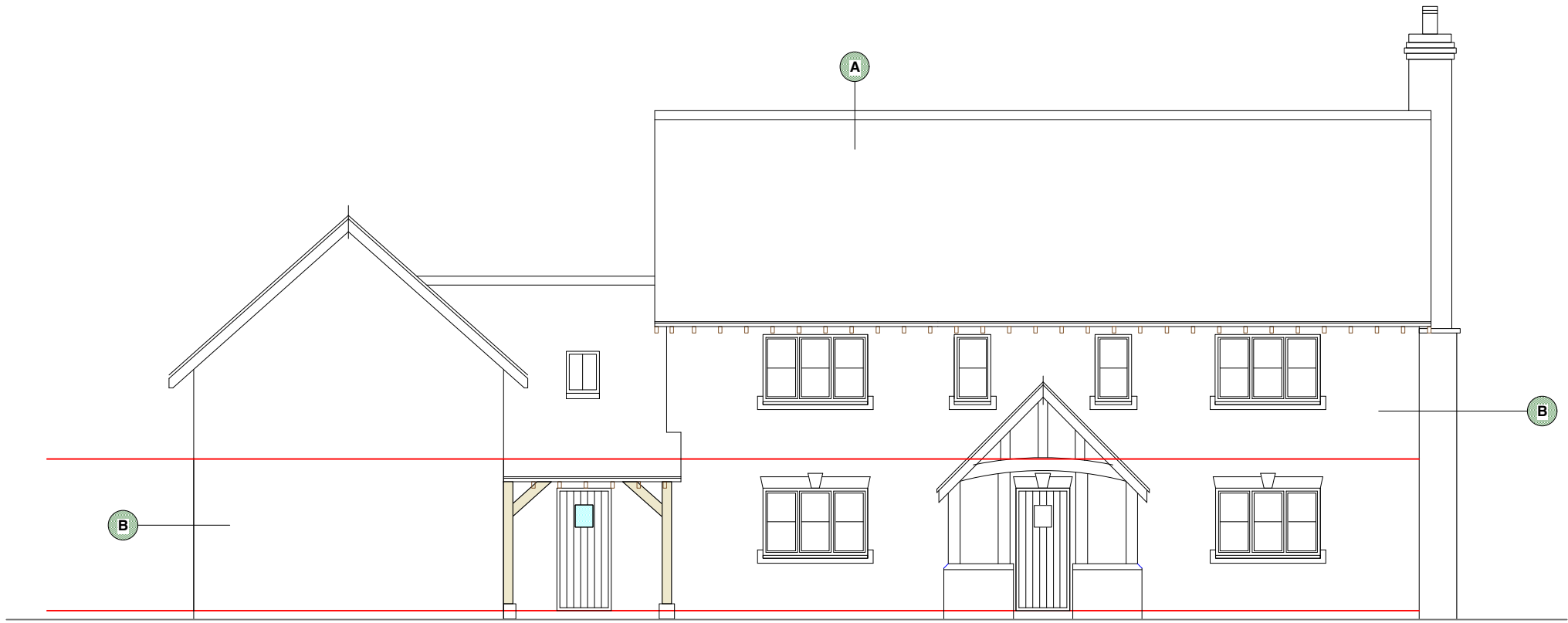
E a s t e l e v a t i o n