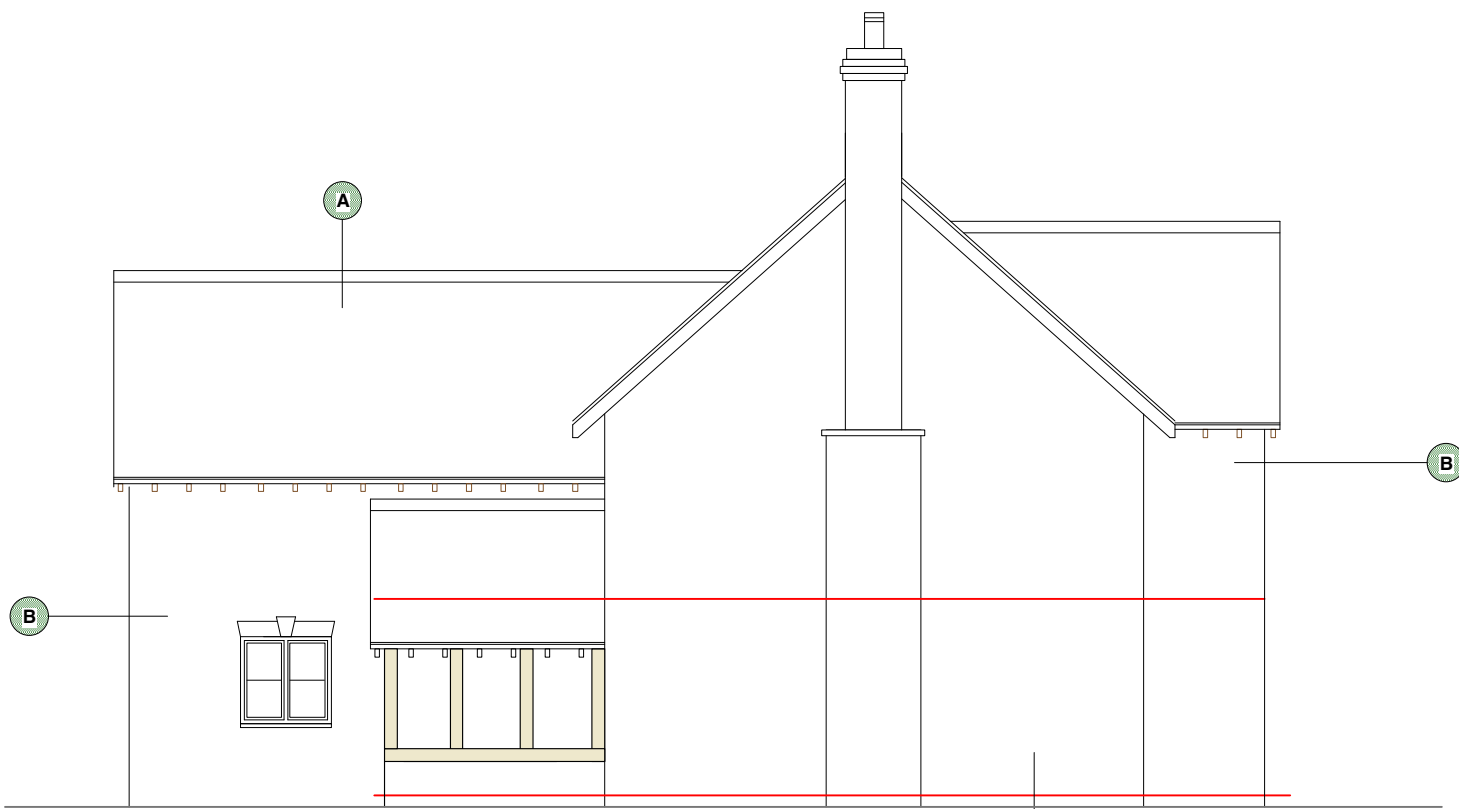
N o r t h e l e v a t i o n