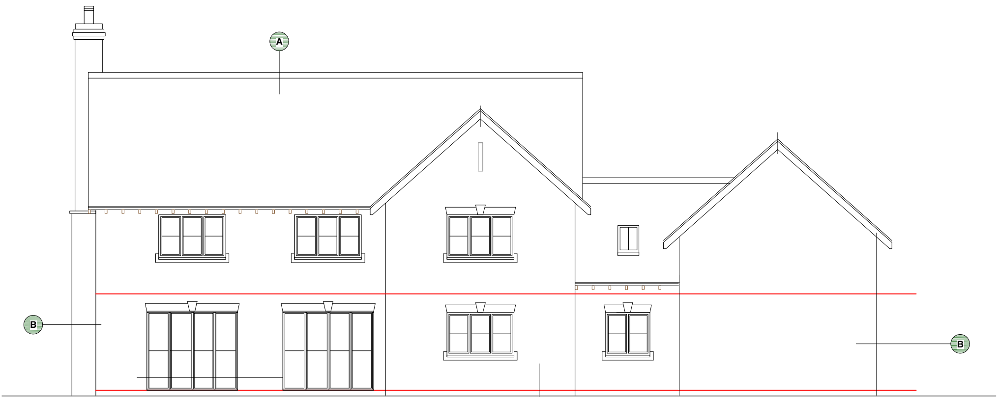
W e s t e l e v a t i o n