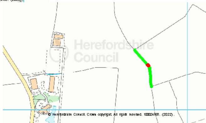
Image 2 Showing the small missing gap of 3.6 m.

The total requested area for removal is 154 m, which is the area that was surveyed on the 16 th of September 2022. It is a well-established hedge and the only gap is the one that can be found in the middle. This makes up less than 10% of the hedgerow. The incline of the land leads to a drop from the hedgerow to the land on the East side of the hedgerow.