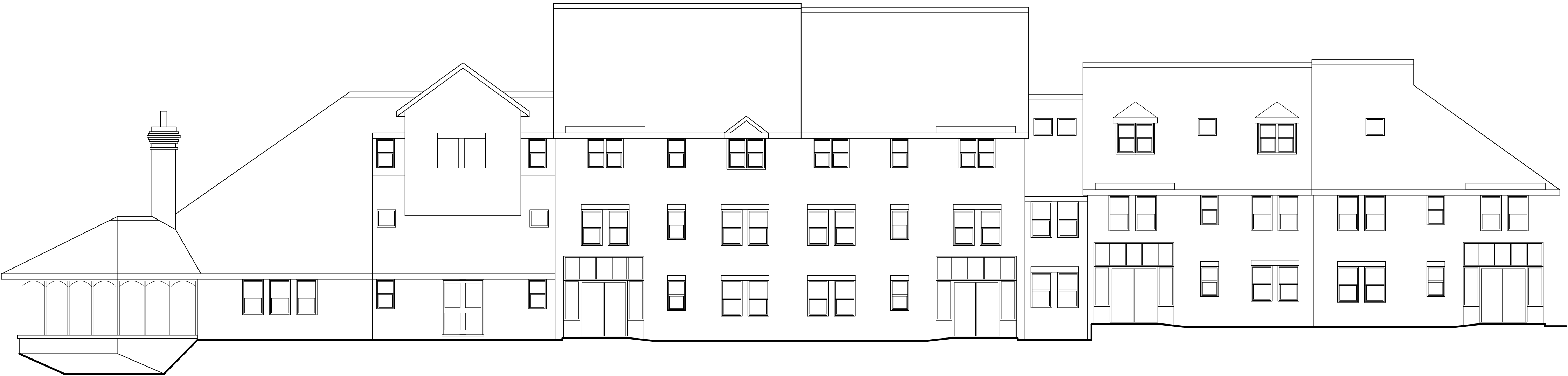
WEST ELEVATION B

EXISTING WINDOWS Aluminium sash windows, white finish.