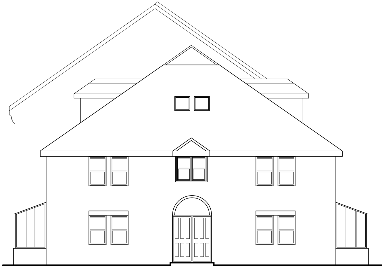
SOUTH ELEVATION B