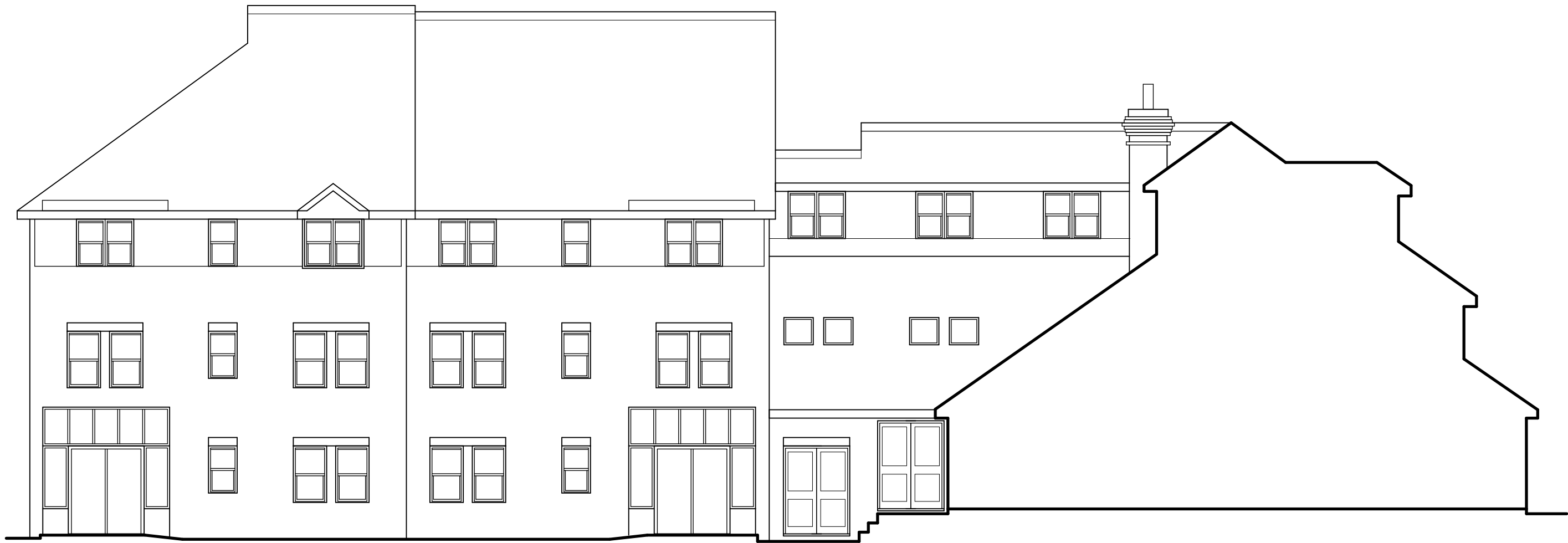
WEST ELEVATION A