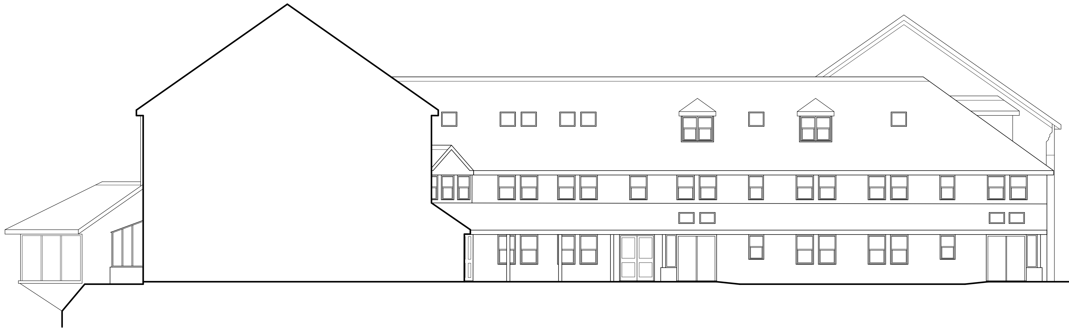
SOUTH ELEVATION A