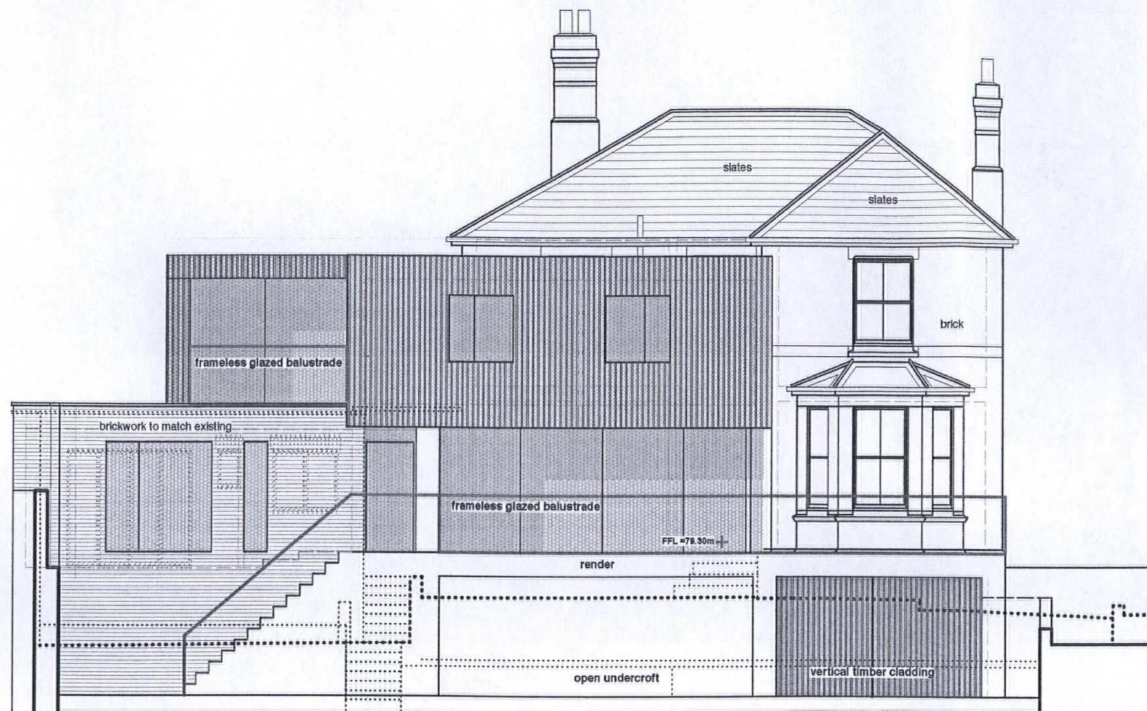
WEST ELEVATION (rear)