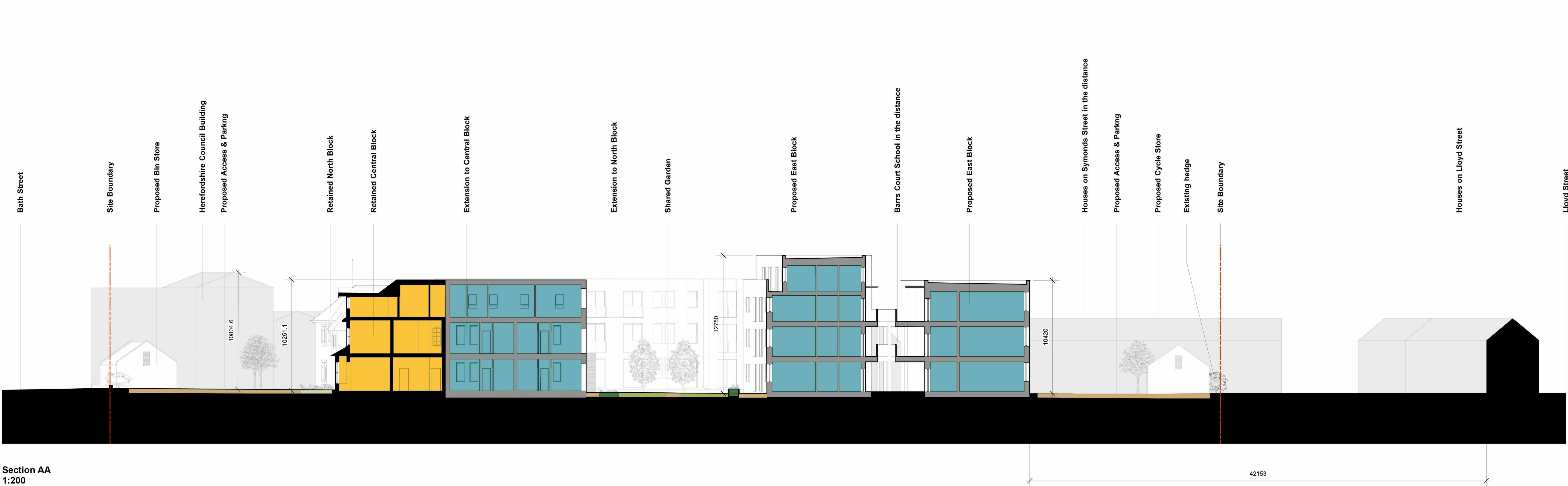
Section AA 1:200