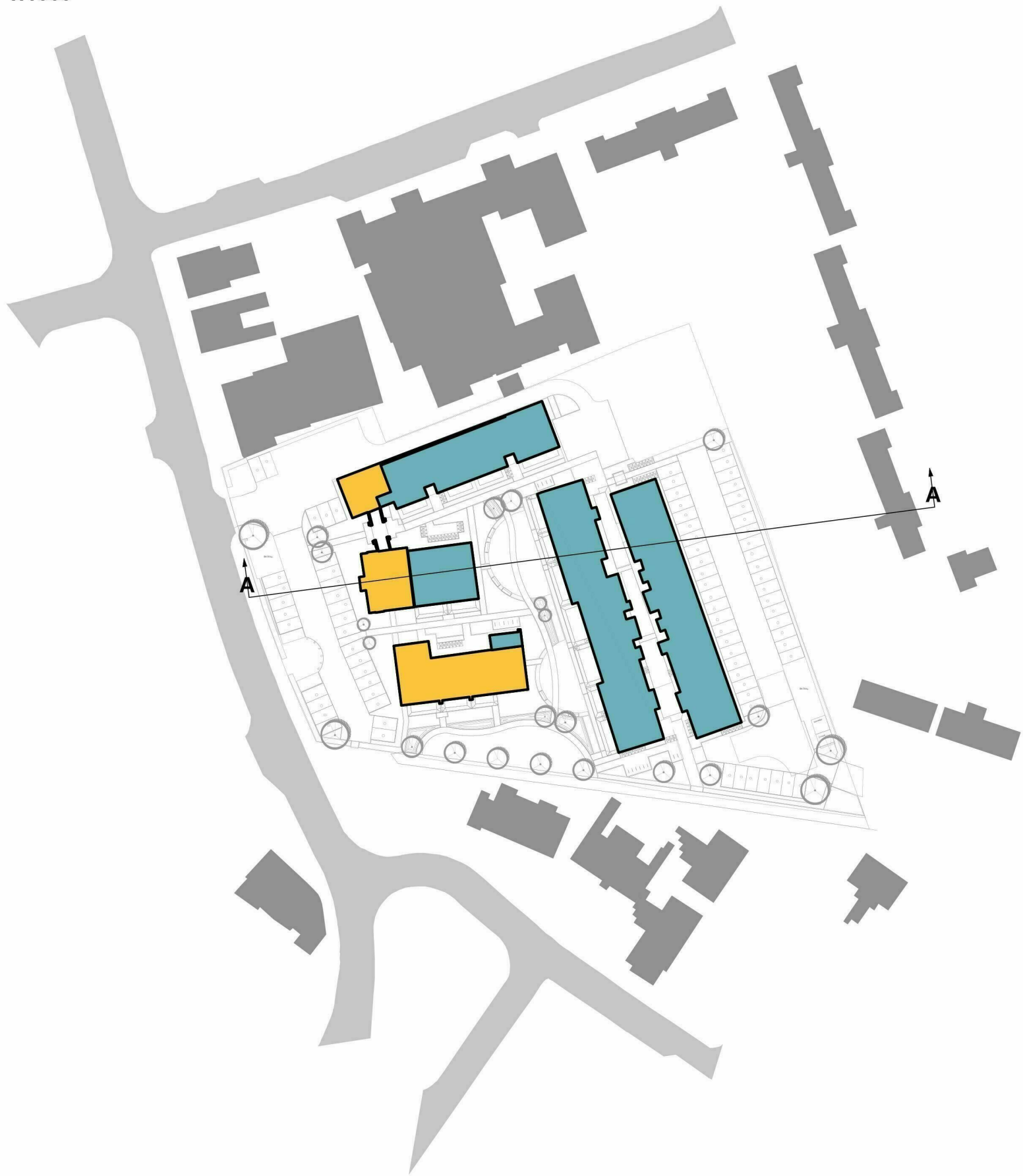
Key Plan 1:1000