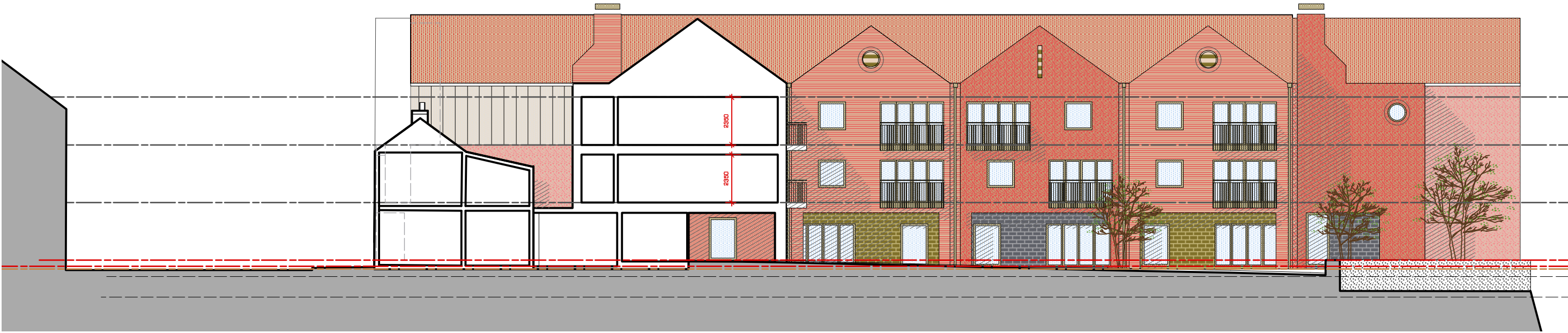
SECTION AA SCALE 1:200 @ A1