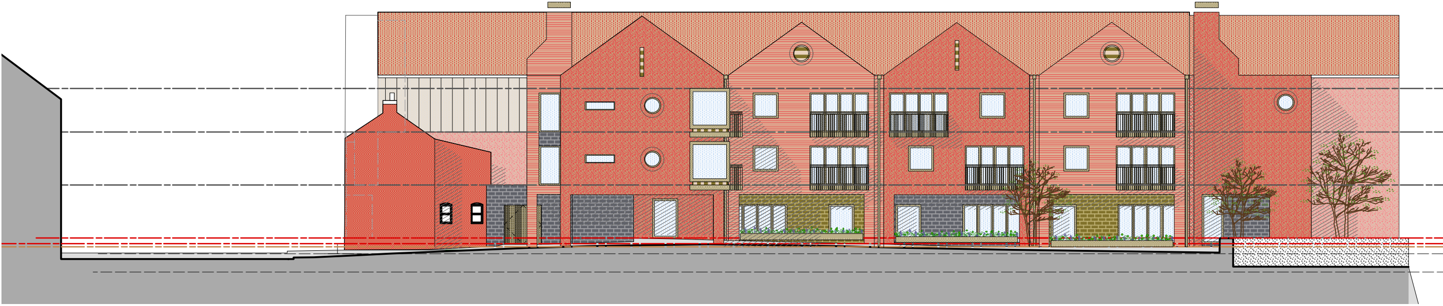
NORTH ELEVATION SCALE 1:200 @ A1