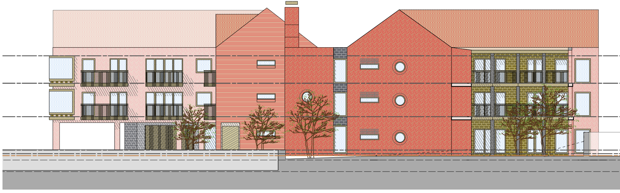
WEST ELEVATION SCALE 1:200 @ A1

Market Street Apartments, Ledbury, Herefordshire