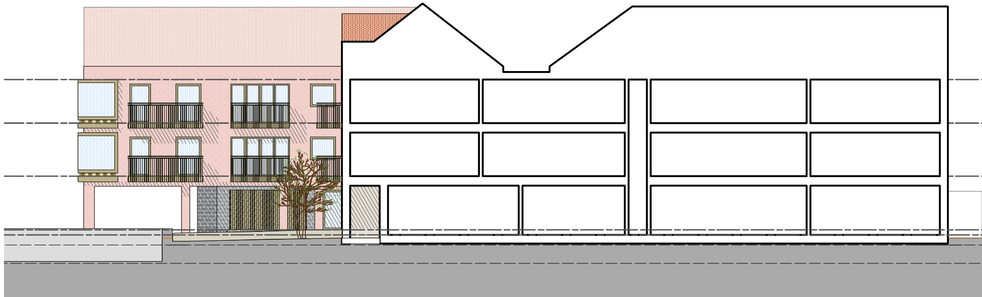
SECTION EE SCALE 1:200 @ A1