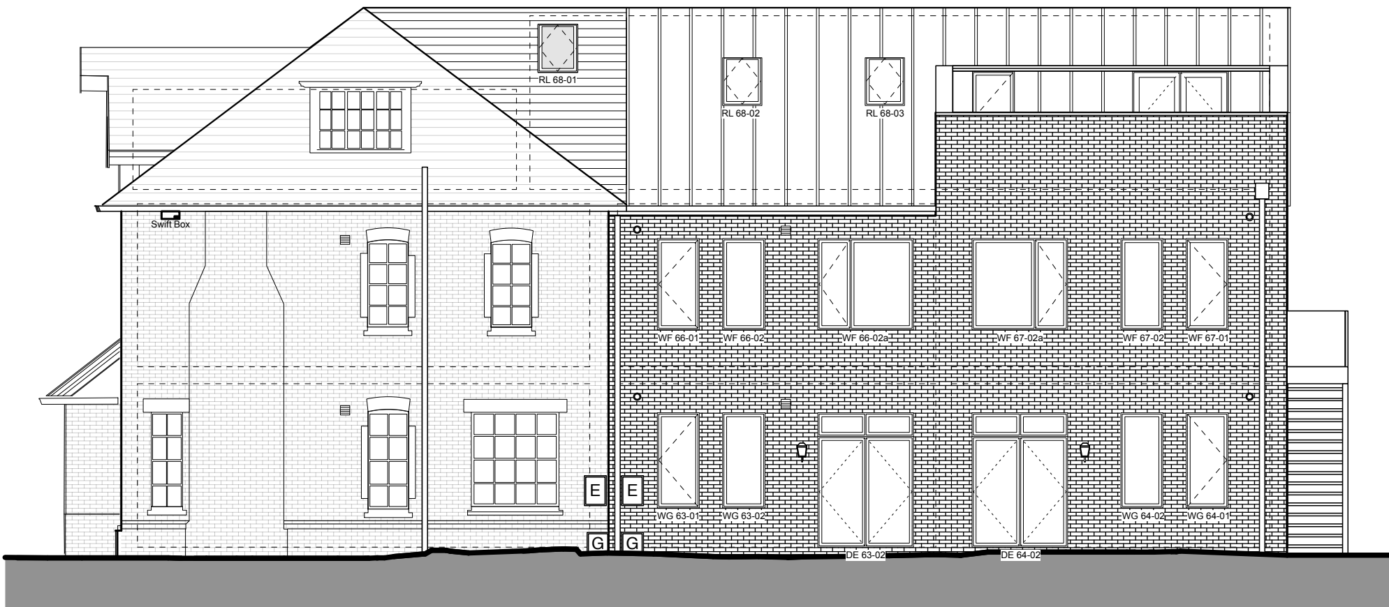
Plot 62, 65 Rear Elevation