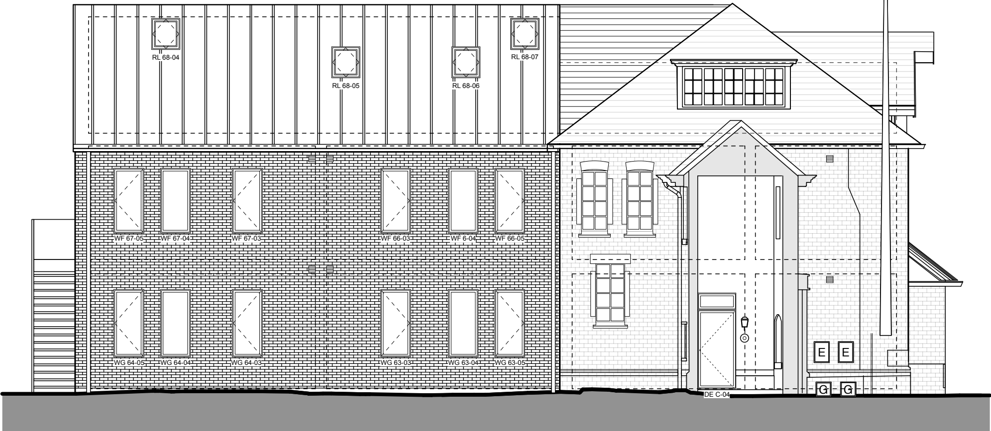
Plot 64, 67, 68 Side Elevation