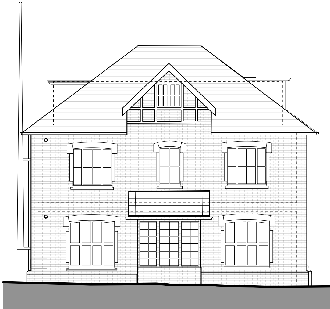
Plot 62, 65 Front Elevation

P1: 28.02.2019 - ALB: Side elvation added P2: 07.03.2019 - ALB: Vents added to North elevation, windows and canopy added to East elevation, windows flipped, opening directions added, doors to east elevation amended P3: 11.03.2019 - ALB: Plot, Window and doors numbering amended, floor levels adjusted, Windows obscured P4: 14.05.2019 - ALB: Floor levels aligned between front and side elevations, ridge of proposed extension aligned with existing roof line, block number added, external stair case amended to steel construction C1: 17.06.2019 - ALB: Swift box added