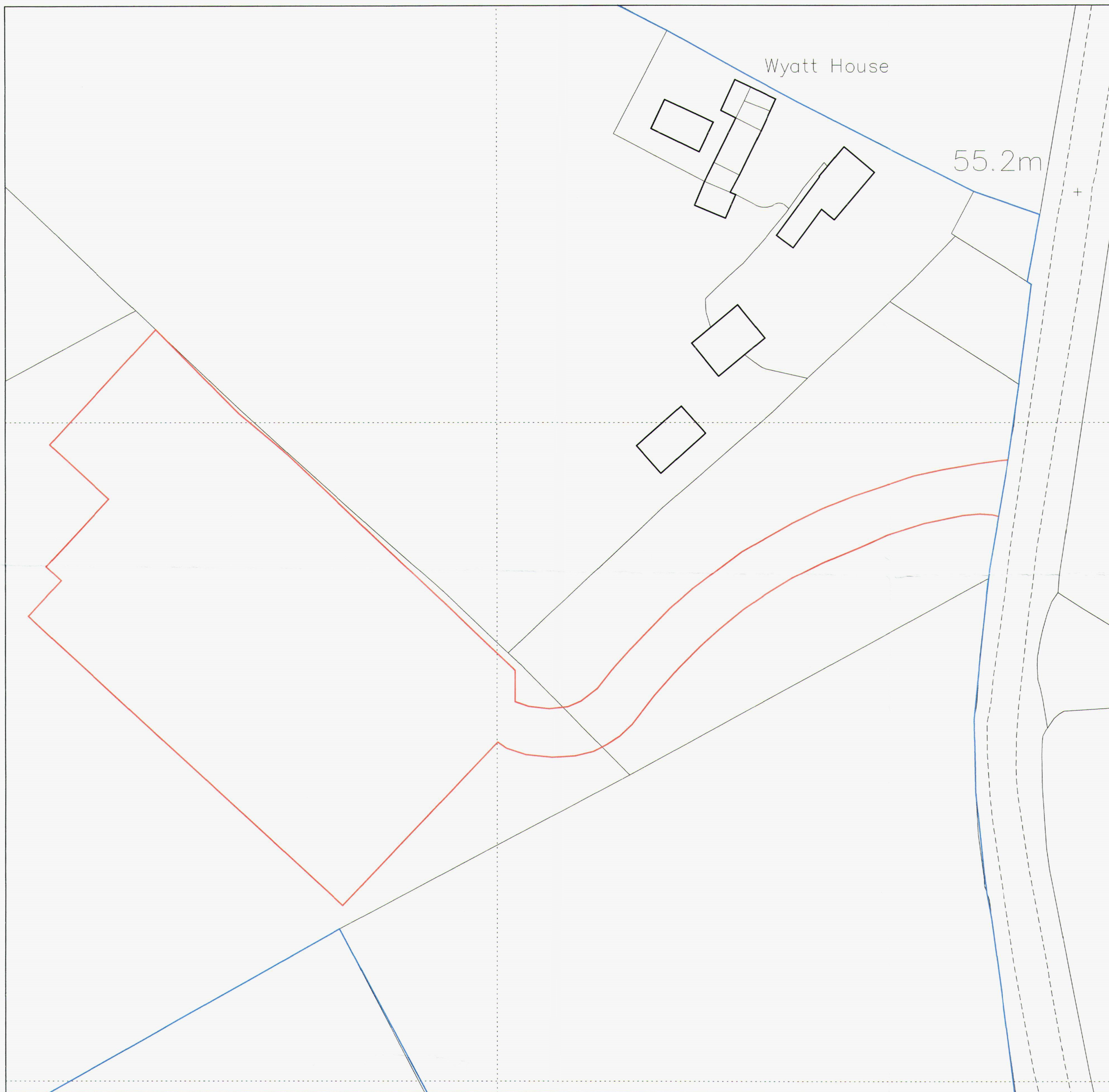
SITE PLAN scale 1:500