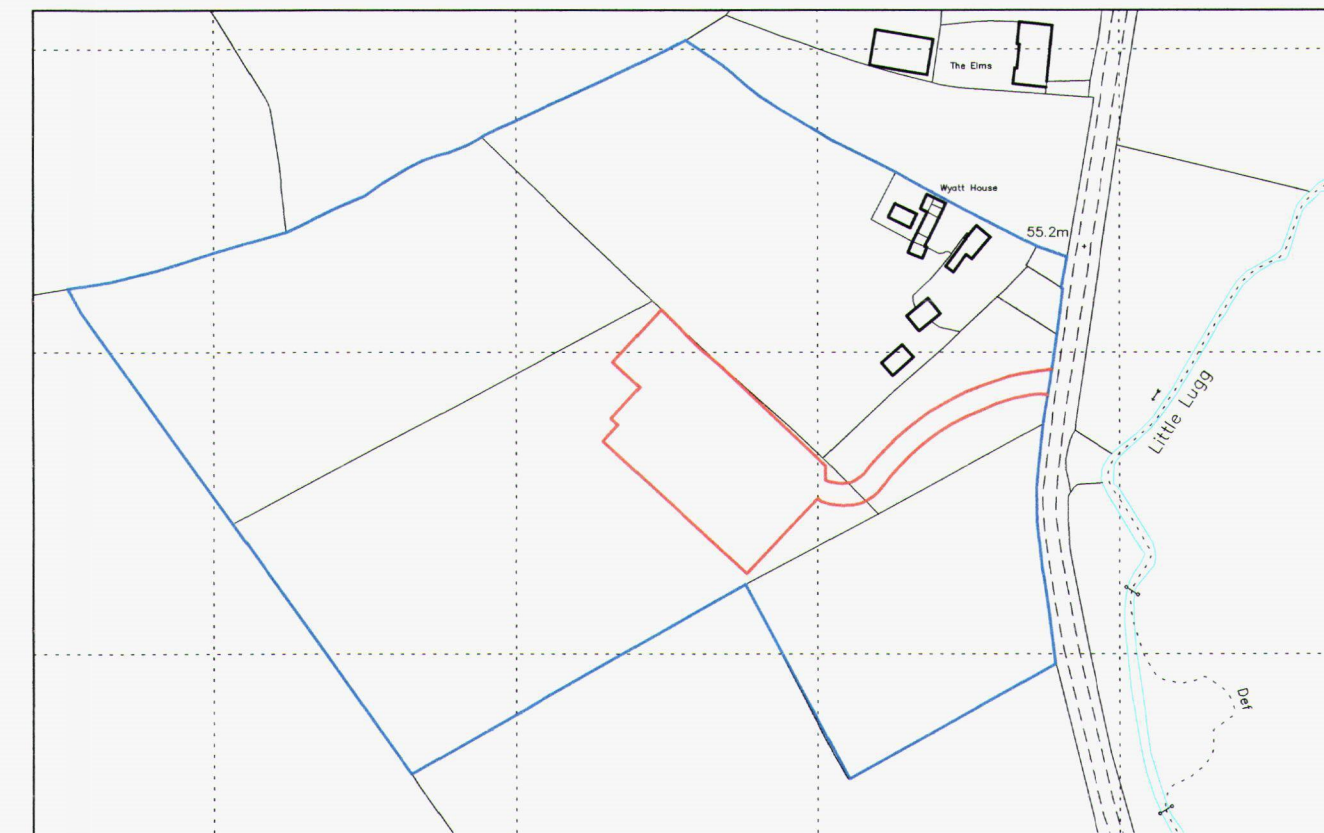
LOCATION PLAN scale 1:2500