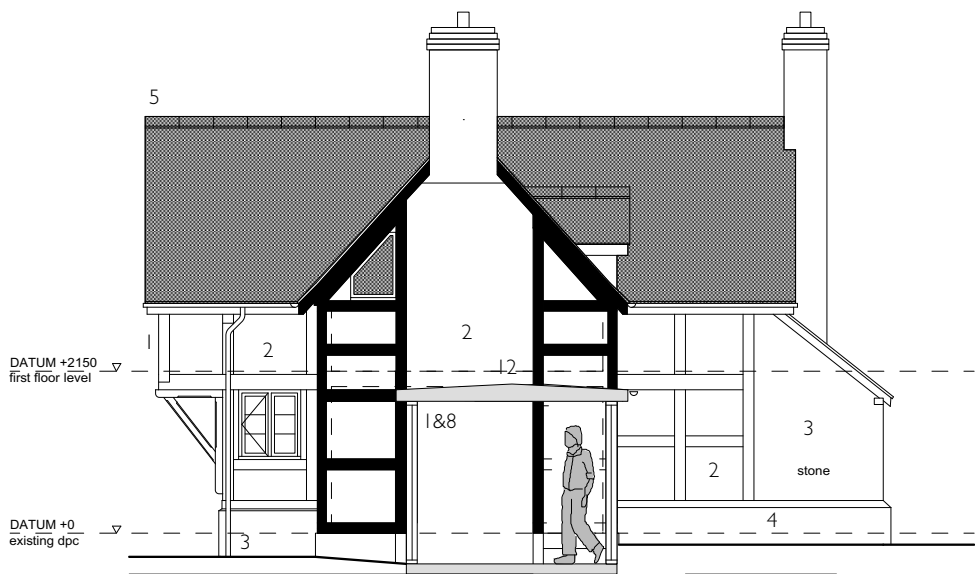
South West Elevation showing section through covered link