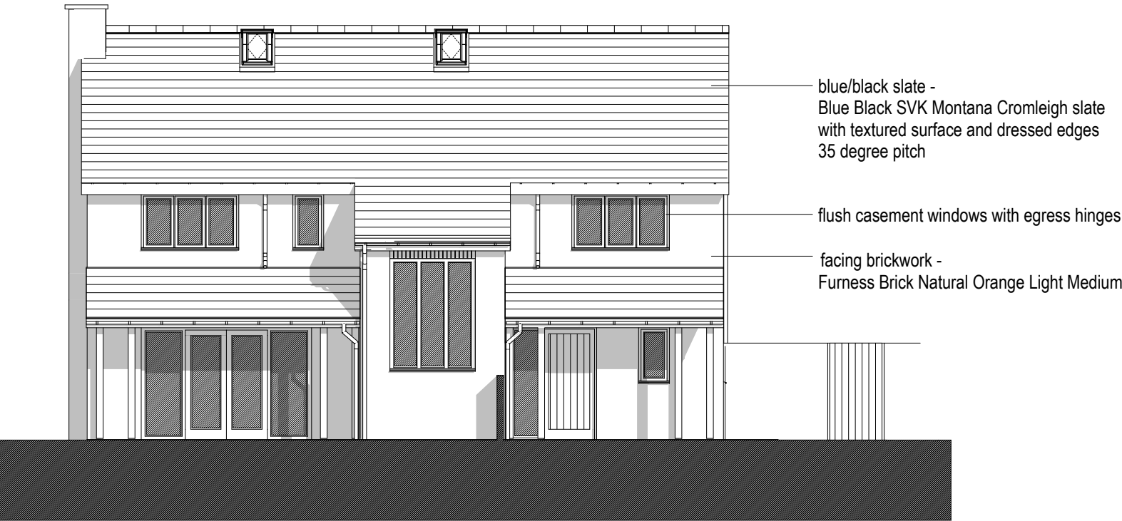
1. FRONT ELEVATION SOUTH