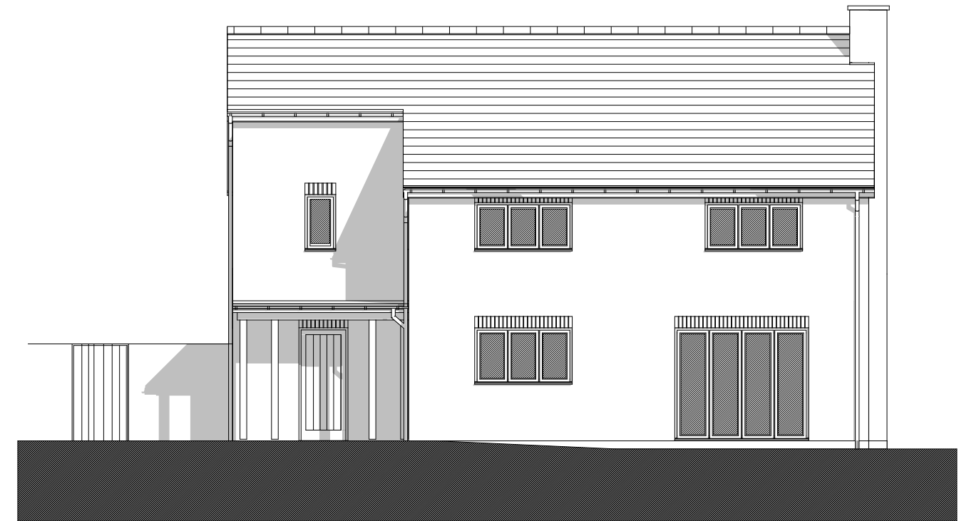
2. REAR ELEVATION